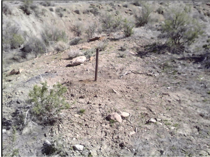
Abandoned Monitoring Well VB-03-10

Number of Partial Inspection this Fiscal Year: 0