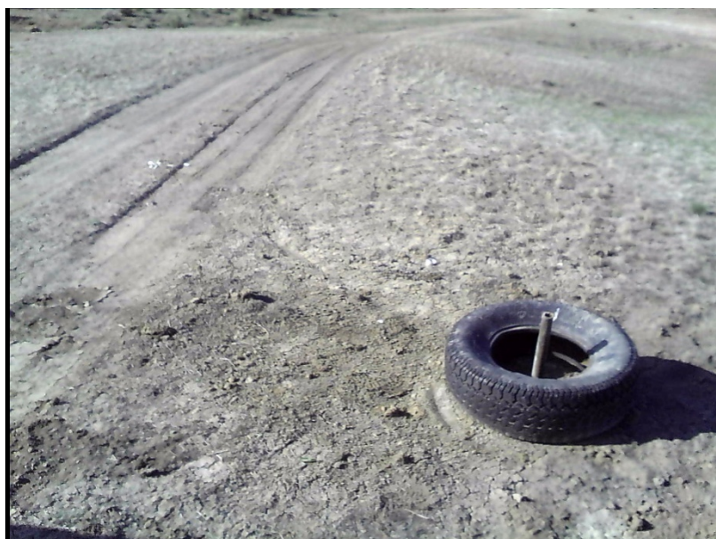
Abandoned Monitoring Well VB-03-06

Number of Partial Inspection this Fiscal Year: 0