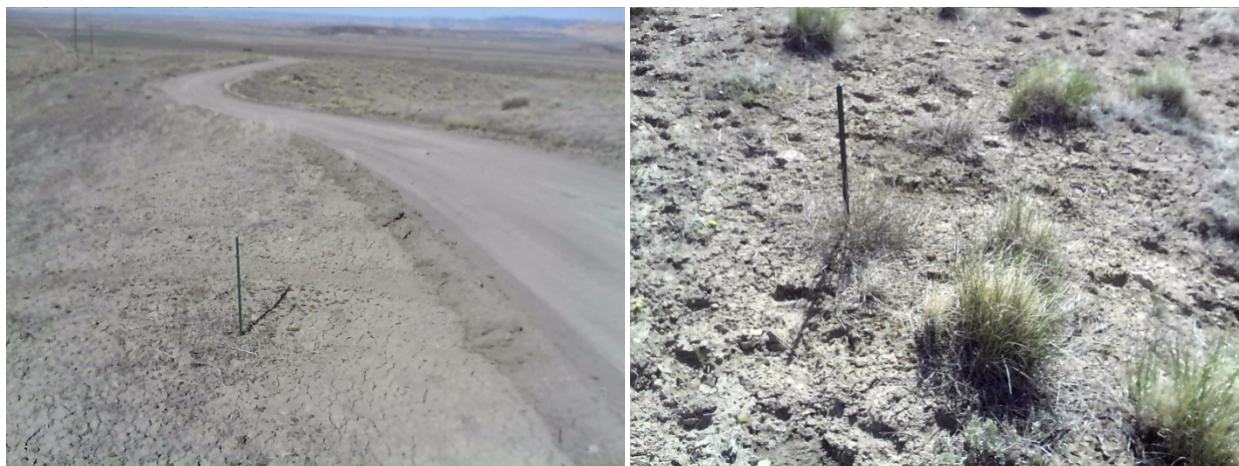
Example of sites that were abandoned in 2006