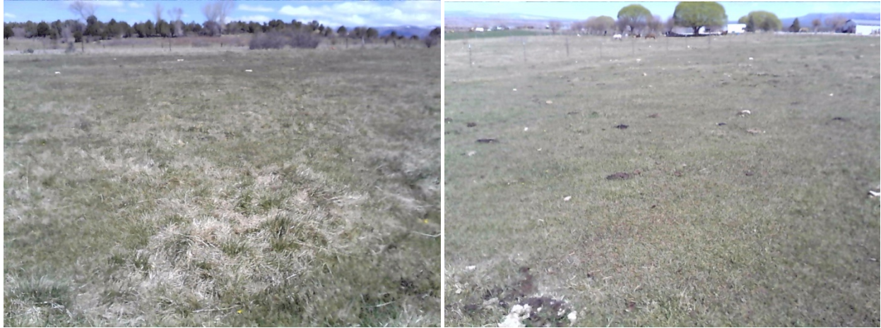
Example of sites located in cropland/pasture (NA08-5 and NA08-10)

Number of Partial Inspection this Fiscal Year: 0