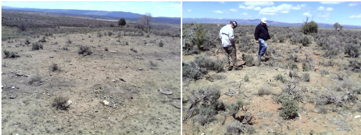
Example of sites not located in cropland (NA08-23 and CB08-34)

Number of Partial Inspection this Fiscal Year: 0