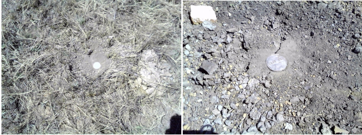
Example of sites where borehole marker was found (NA08-29 and NA08-20)