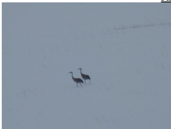
Sand Hill Cranes along Tie-Across Haul Road.