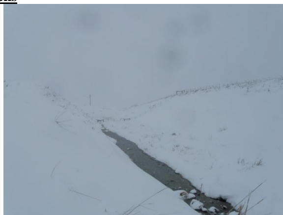
Ditch 8 along rail loop.