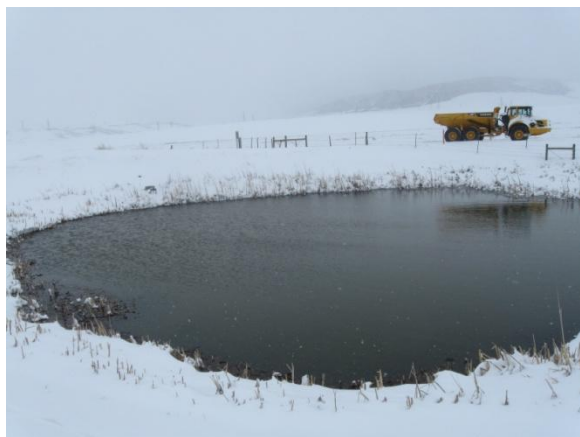
Truck Loop Pond