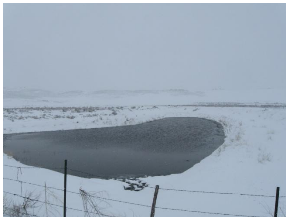
Rail Loop Pond.

Number of Partial Inspection this Fiscal Year: 6