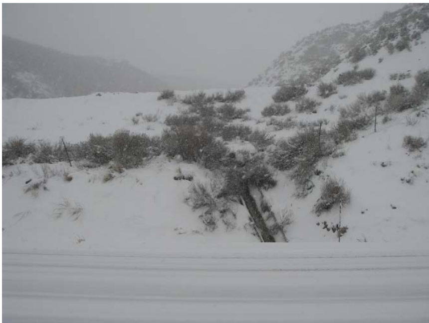
Prospect Pond embankment and discharge channel

Number of Partial Inspection this Fiscal Year: 9