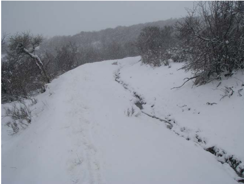
Section 16 Pond Ditch