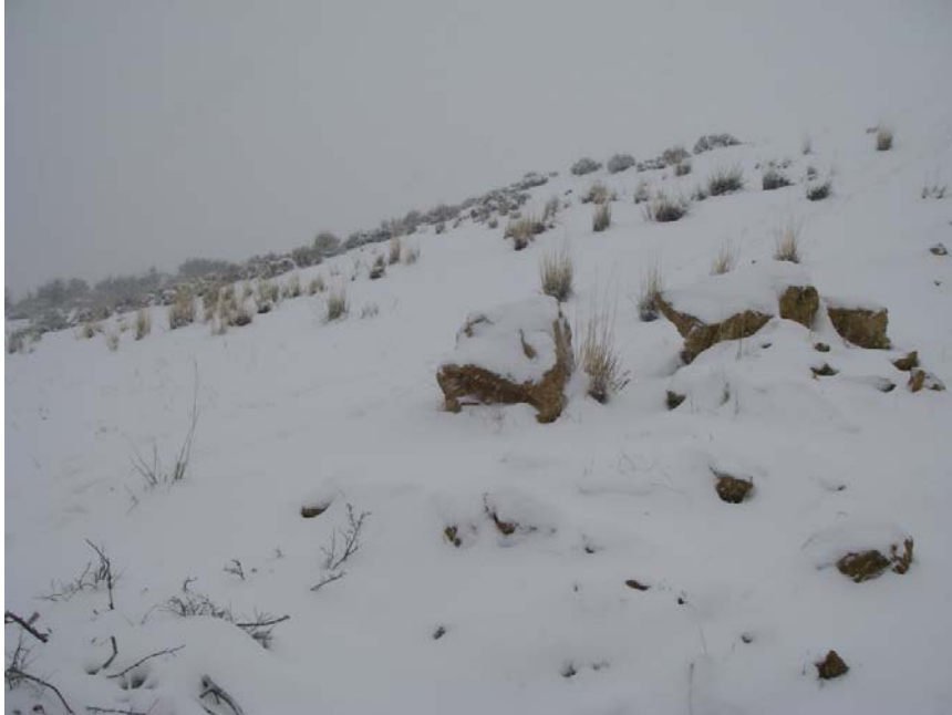
Section 16 Pond embankment