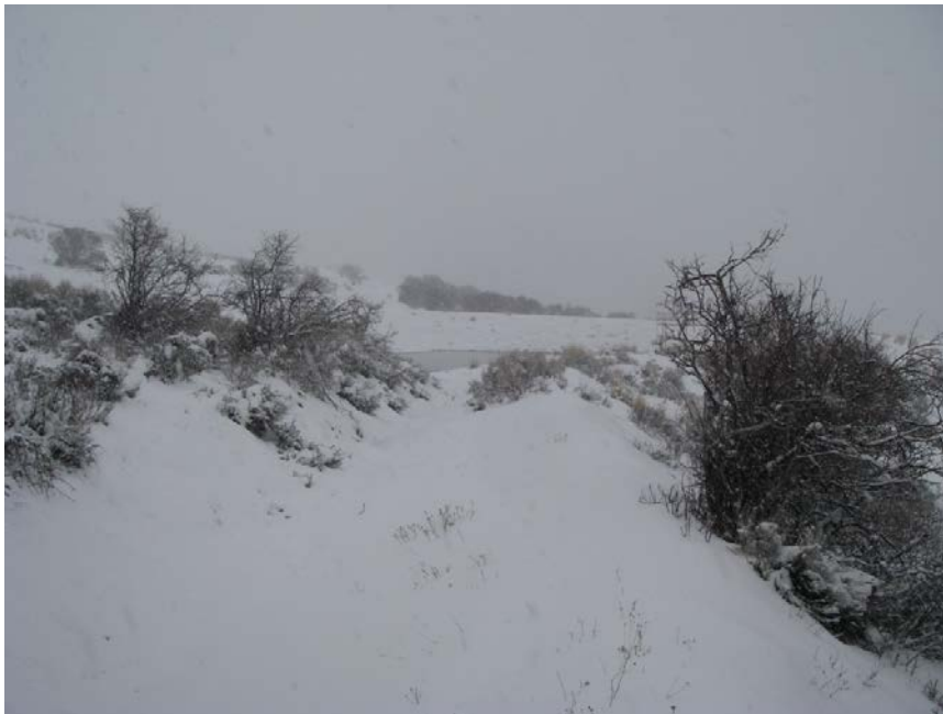
Section 16 Pond Ditch as it enters the pond

Number of Partial Inspection this Fiscal Year: 9