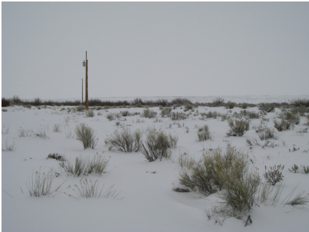
Reclamation at Loadout, looking south

Number of Partial Inspection this Fiscal Year: 7