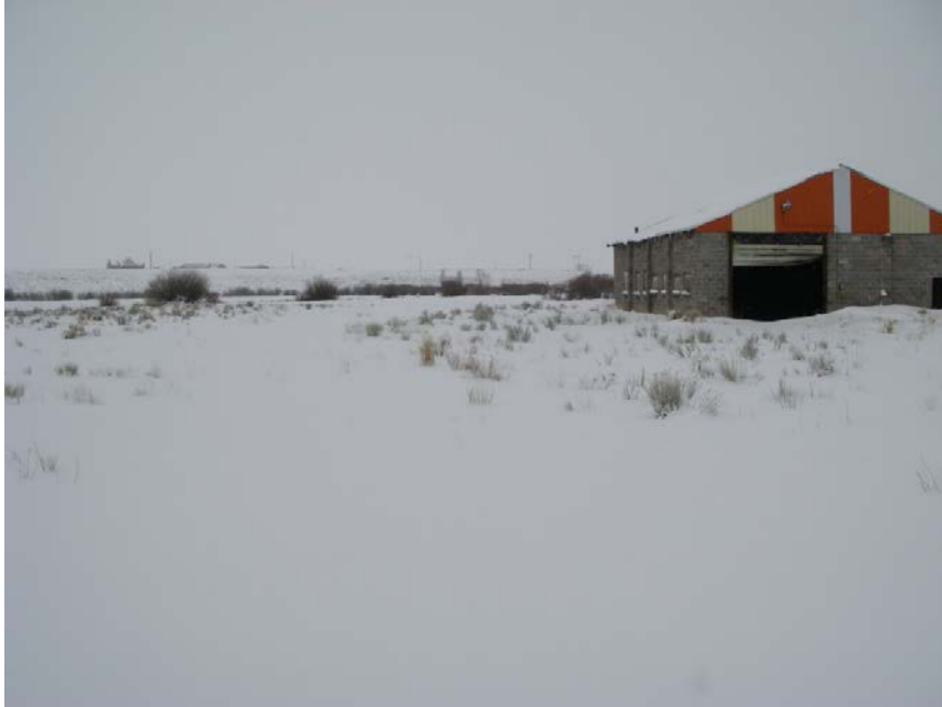
Area at Loadout where reclaimed pond was accessed, looking west