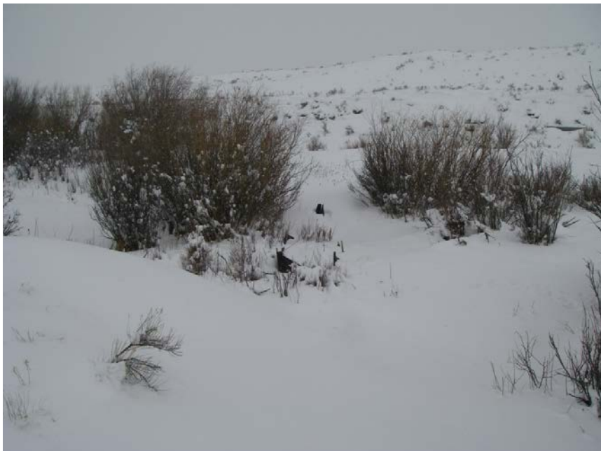
BMPs below reclaimed pond area

Number of Partial Inspection this Fiscal Year: 7