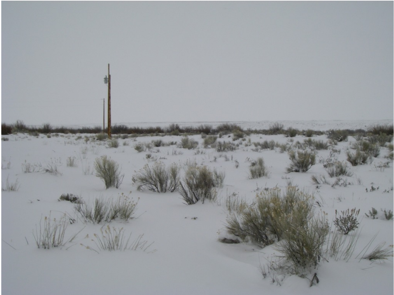
Reclamation at Loadout, looking south

Number of Partial Inspection this Fiscal Year: 7