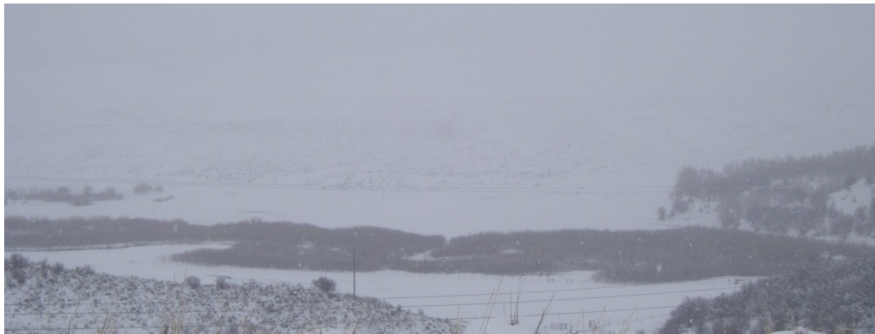
Center of site, taken from State Route 131