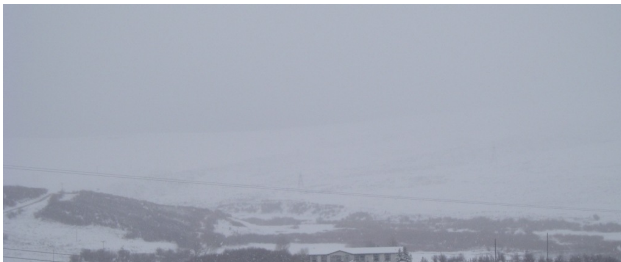
South end of site, taken from State Route 131

Number of Partial Inspection this Fiscal Year: 7