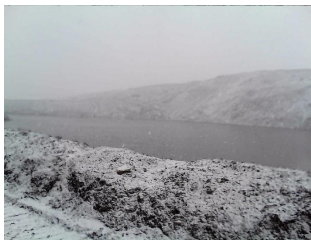
Area 1 Pit