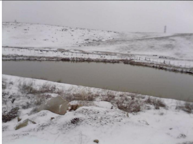
6 MN Sediment Pond

At the time of the inspection TC was discharging to Fish Creek at Site 115, the Fish Creek Borehole site. The discharge is due to a failed pump, which has forced TC to tie into the water pipe from 18 LT and send the water underground at the Fish Creek Borehole. The construction of the 18 LT pipe is currently bonded under the Foidel Creek Mine Permit.