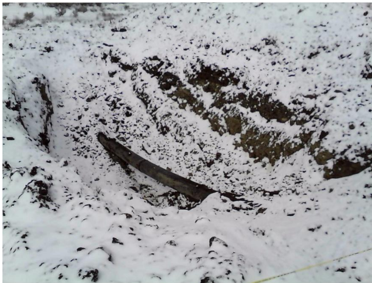
18 LT Water Pipeline at Fish Creek Borehole

At the time of the inspection TC was discharging to Fish Creek at Site 115, the Fish Creek Borehole site. The discharge is due to a failed pump, which has forced TC to tie into the water pipe from 18 LT and send the water underground at the Fish Creek Borehole. The construction of the 18 LT pipe is currently bonded under the Foidel Creek Mine Permit.