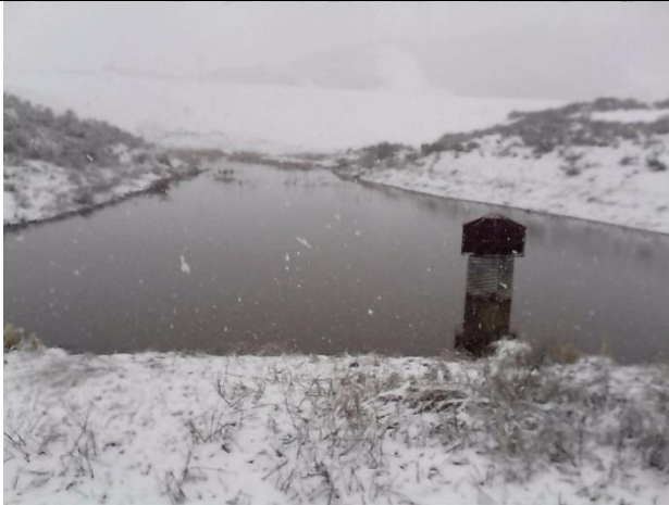
Fish Creek Tipple Pond