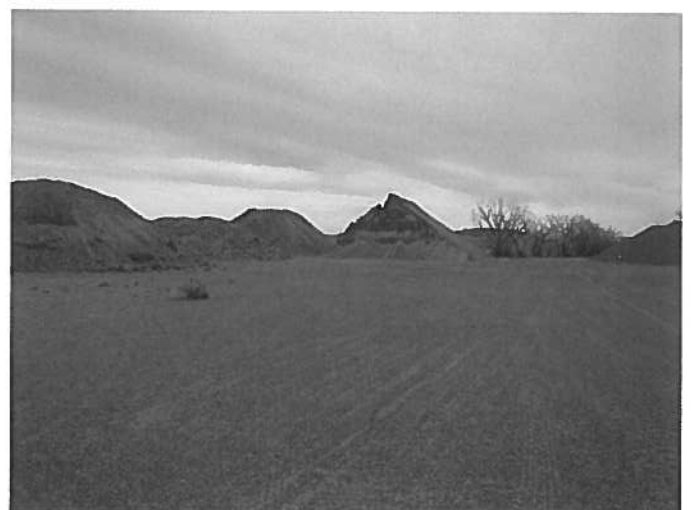
Figure 4: Stockpile area located on the east side of the pond.