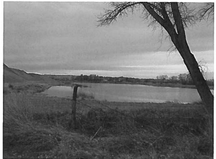
Figure 2: View from the north side of the pond, facing south.