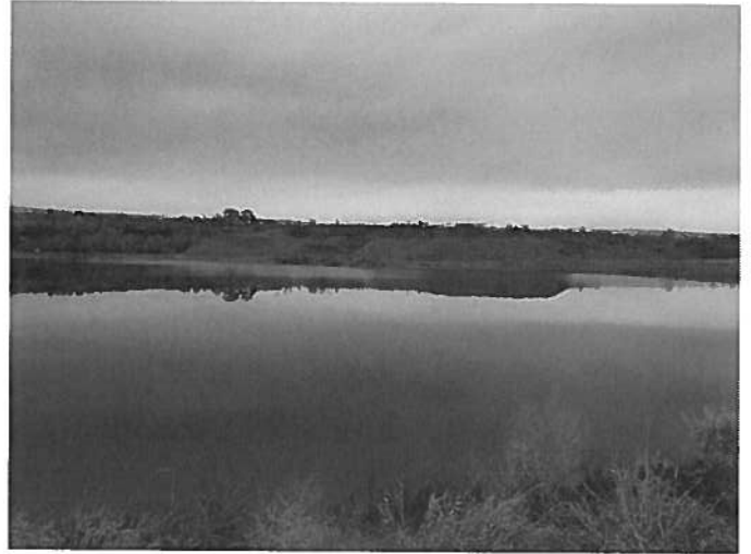
Figure 6: View from the southwest corner of the pond, facing northeast.