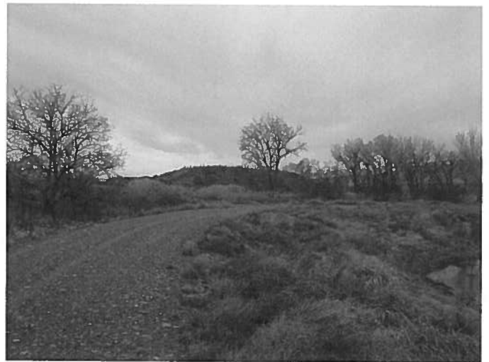
Figure 8: Topsoil stockpile located on the southwest side of the pond.