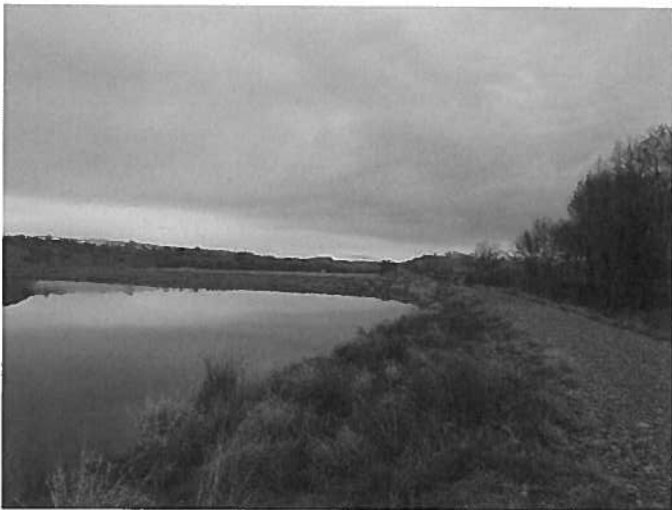
Figure 7: View from the southwest corner of the pond, facing east.