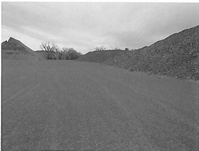
Figure 3: Stockpile area located on the east side of the pond.