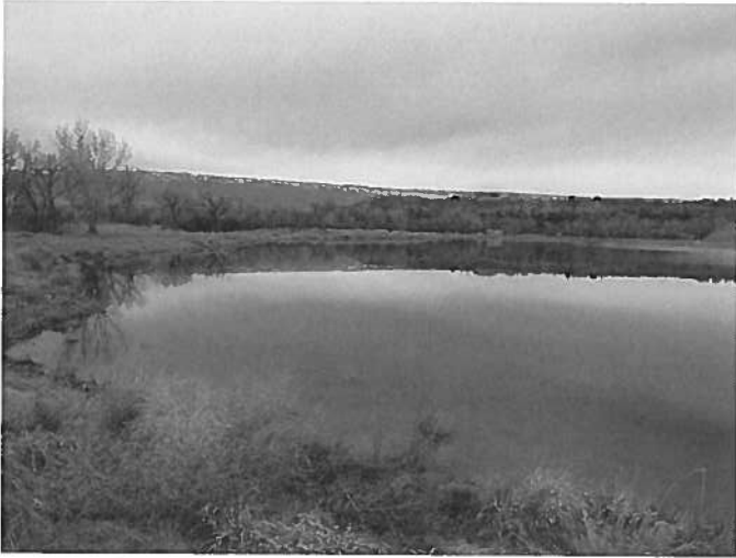
Figure 5: View from the southwest corner of the pond, facing north.