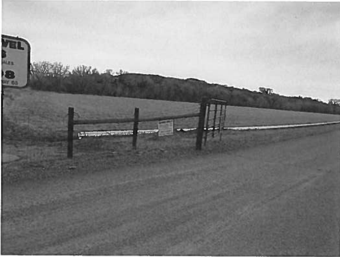
Figure 1: Mine identification sign was located at the entrance to the site.