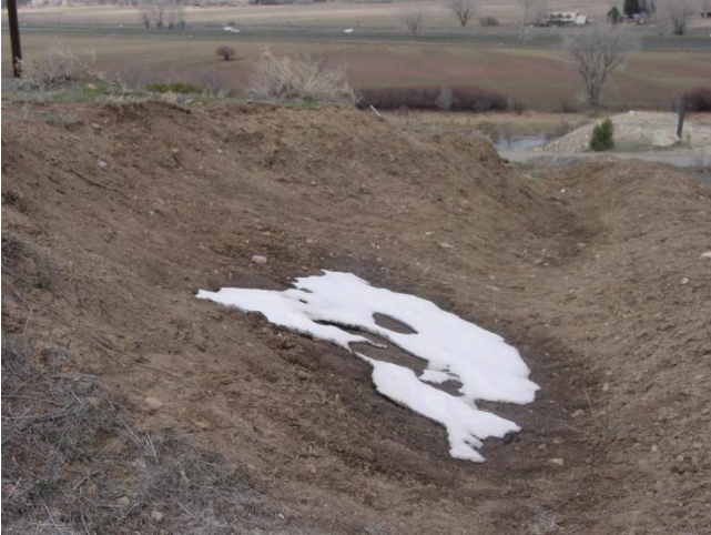
Eastern edge of Topsoil Stockpile #2.

Number of Partial Inspection this Fiscal Year: 0