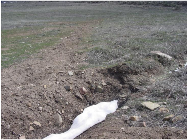
Reestablished Ditch 3.