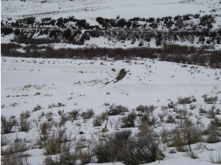
Moffat Pond embankment