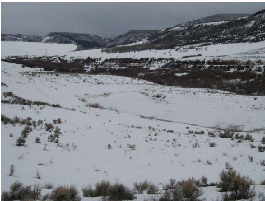
Moffat Pond - south side of pond

Number of Partial Inspection this Fiscal Year: 7