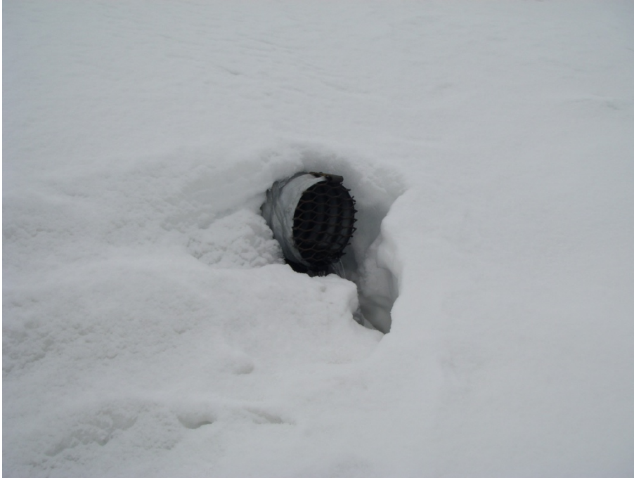
Moffat Pond - outlet of primary spillway (new grate has been added)

Number of Partial Inspection this Fiscal Year: 7