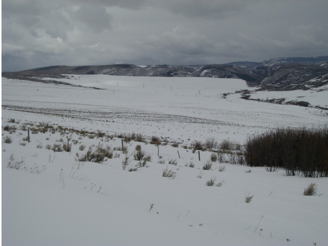
Edna Mine, looking south from north end of site

Number of Partial Inspection this Fiscal Year: 7