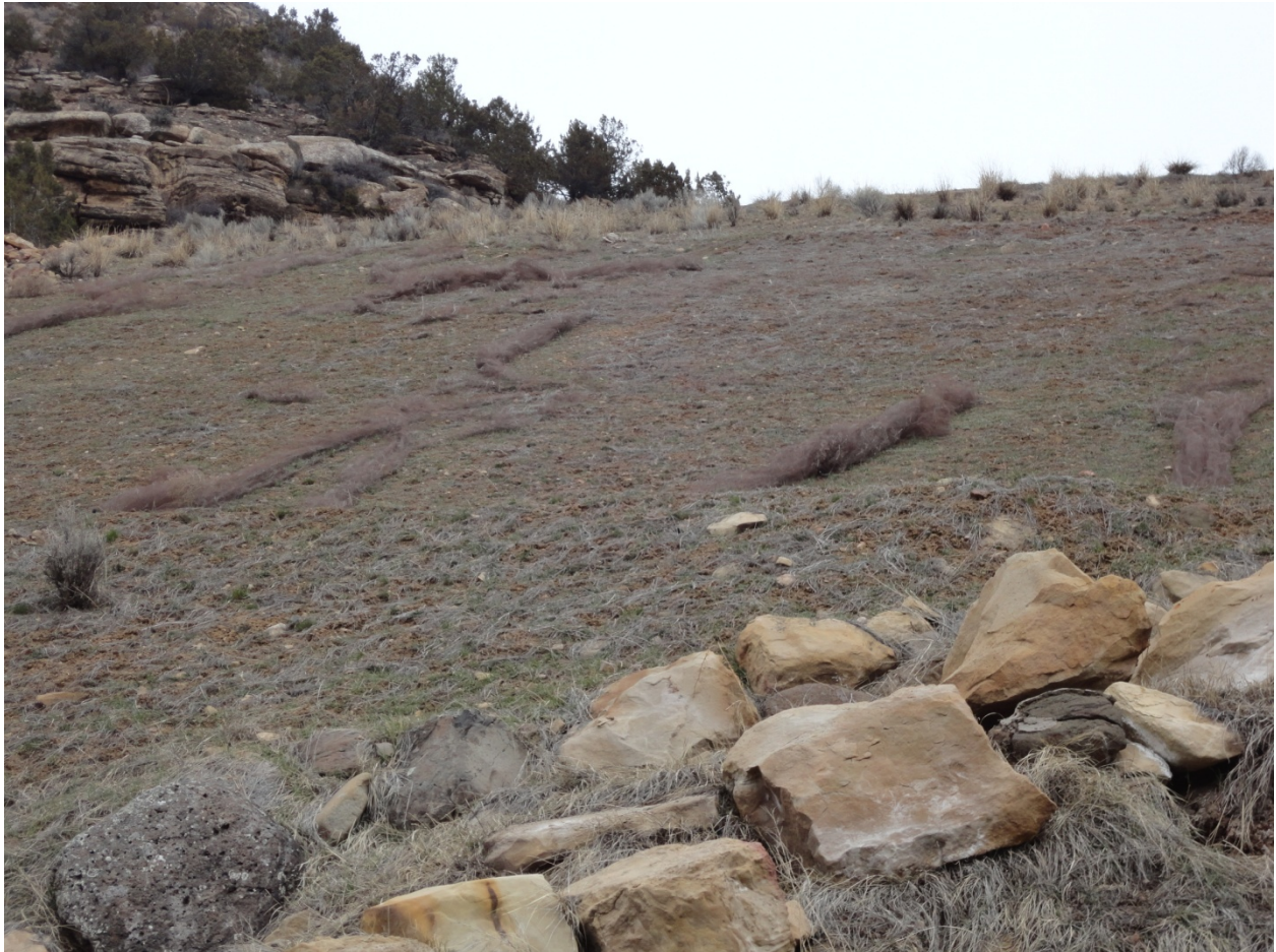
Netting rolls on West Valley fill surface

Number of Partial Inspection this Fiscal Year: 9