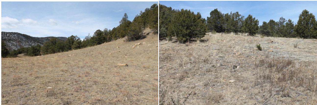
SCF-1 Vent Shaft Pad

Vegetative cover of the site was adequate to control erosion. No evidence of erosion was observed on the site and no infestations of noxious or invasive weeds were present at the time of the inspection.