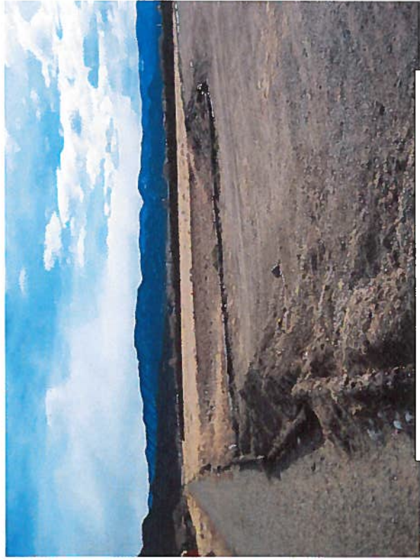
Looking ESE from Peaks View Trail