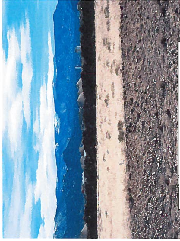
Looking SSE from Peaks View Trail