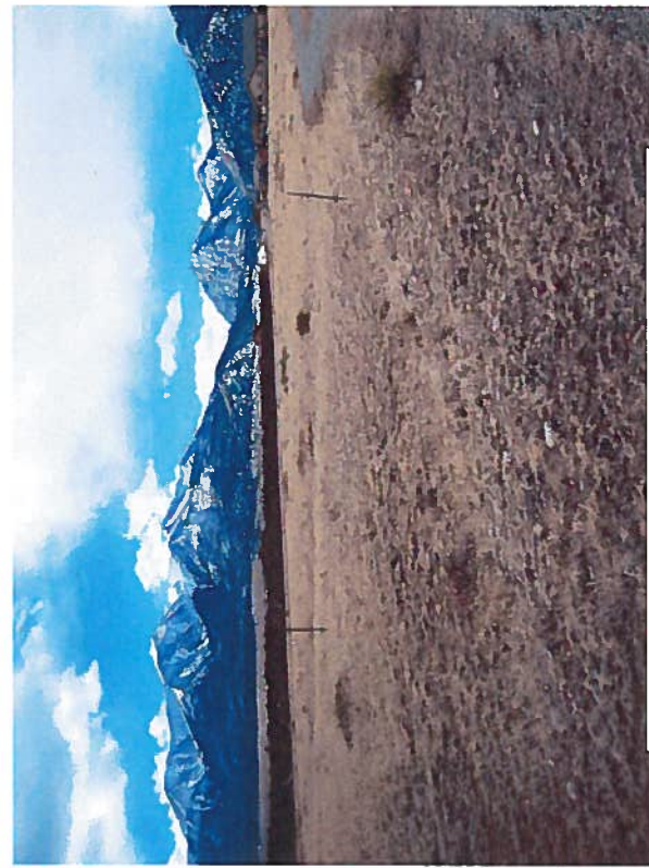
Looking WSW from Peaks View Trail