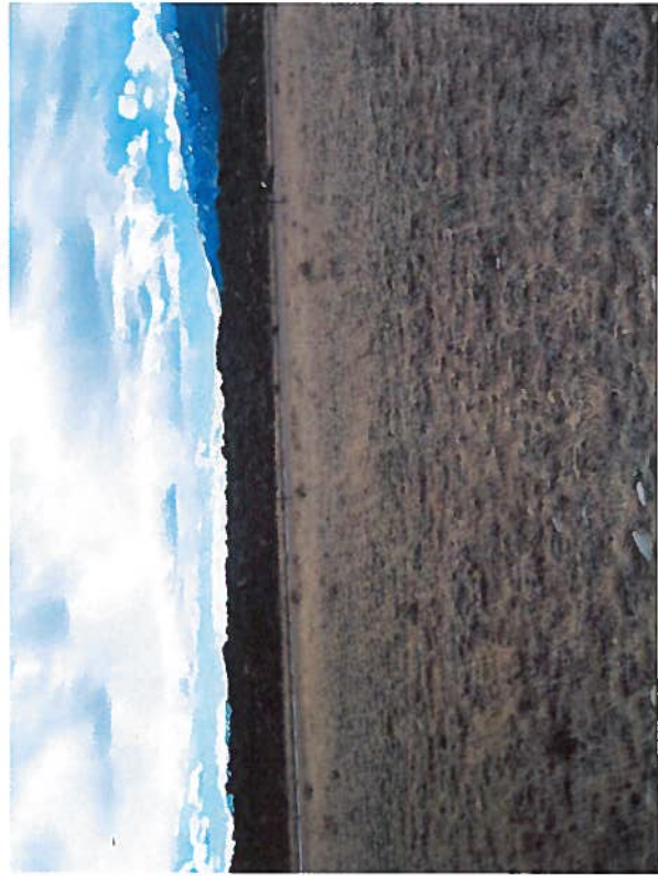
Looking S from Peaks View Trail