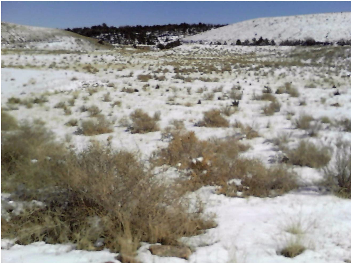
Photo 3: Reclaimed portal facilities area. Ponderosa, Pinyon, and Juniper seedlings are noted as darker spots in this photo.

Number of Partial Inspection this Fiscal Year: 7