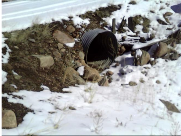
Photo 1: Thompson driveway culvert inlet. No flow in Newlin Creek yet. Newlin Creek remains snow covered.