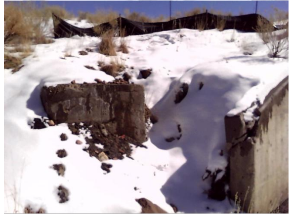
Photo 2: Silt fence at truck tunnel rill repair. Operator seeded with Corley seed mix on 2/26/2013