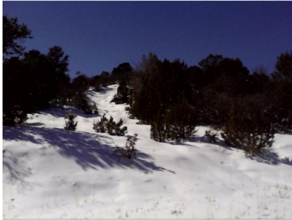
Photo 4: Disturbance in locale of proposed PJ reference area. Photo 5: North end of proposed PJ reference area.