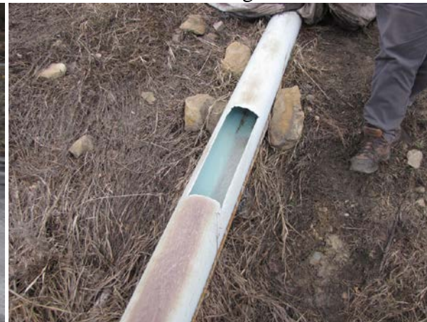
Photo 4 - Pond B Discharge to Deer Trail Ditch