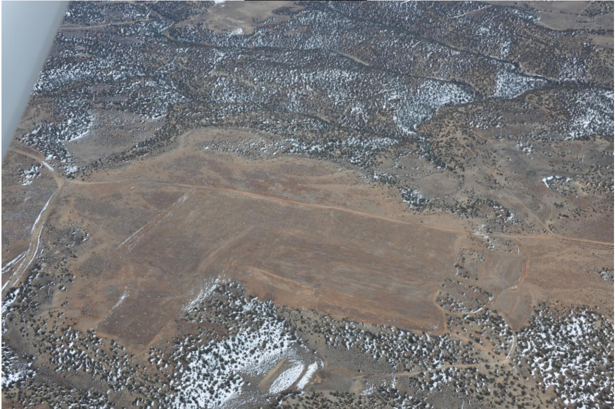
Mine Area No. 1, Topsoil Stockpile No. 1 and Pond A area. Pond B is also visible.

Number of Partial Inspection this Fiscal Year: 5