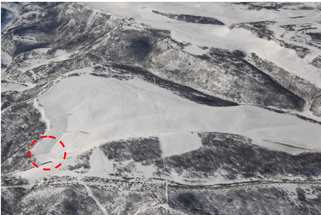
Head Pit area, Pond 011A visible

Number of Partial Inspection this Fiscal Year: 10