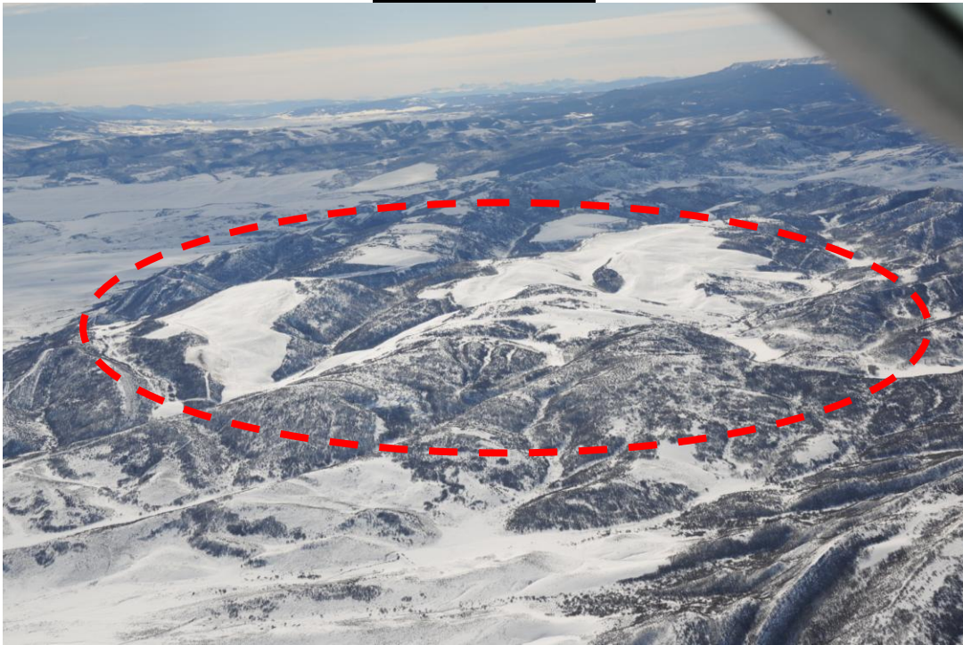
Entire mine site from the west looking east.

Number of Partial Inspection this Fiscal Year: 10