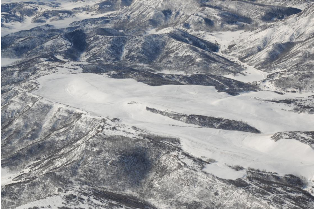
Southern Mining Area

Number of Partial Inspection this Fiscal Year: 10