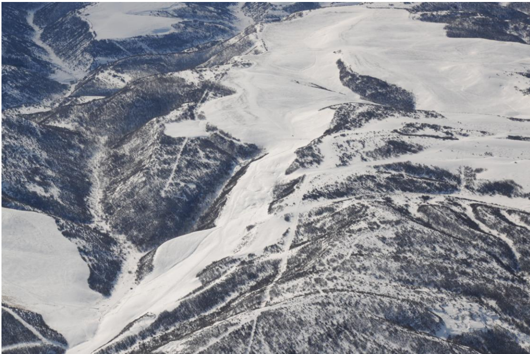
Neck Pit and southern pit area.

Number of Partial Inspection this Fiscal Year: 10