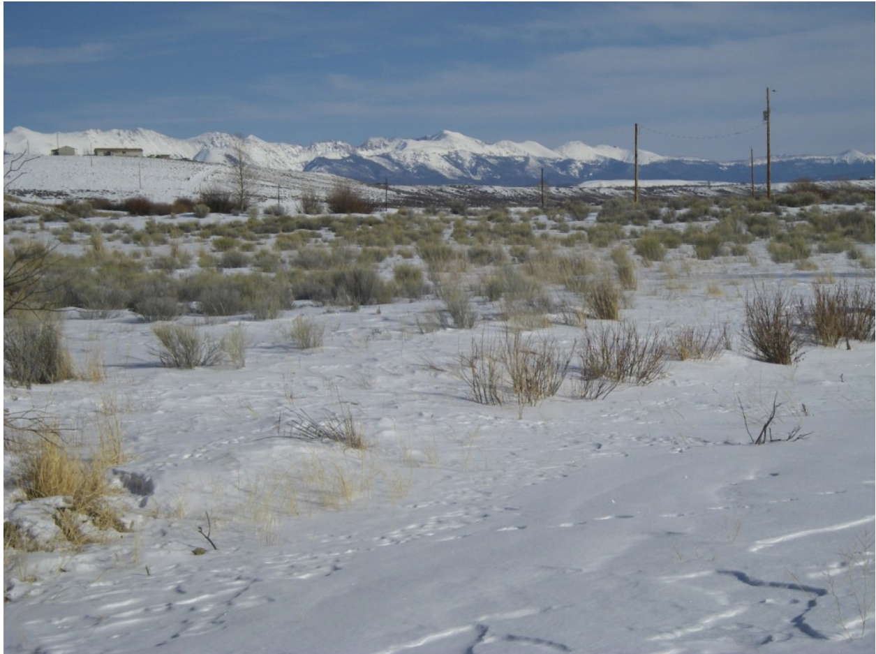
Loadout looking east

Number of Partial Inspection this Fiscal Year: 6