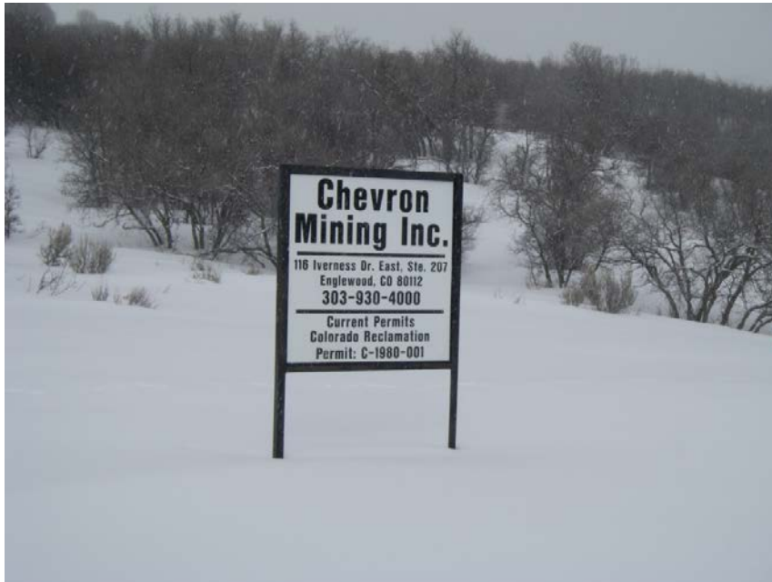
The entrance sign at the east entrance (off Highway 131)