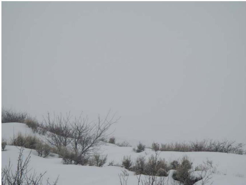
West Ridge is in background (not visible due to snow)

Number of Partial Inspection this Fiscal Year: 6