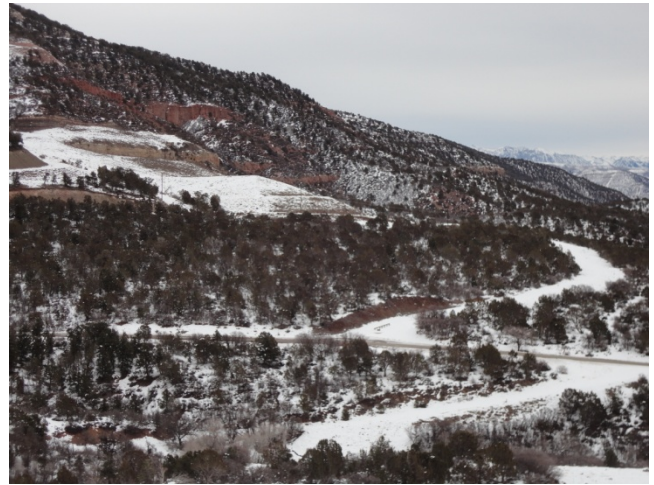
East Mine haul road and refuse area (center of photo)