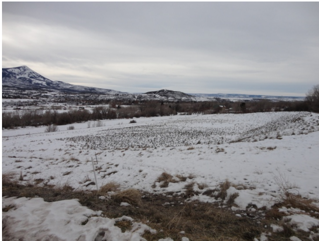
Coal stockpile area at west end of Loadout