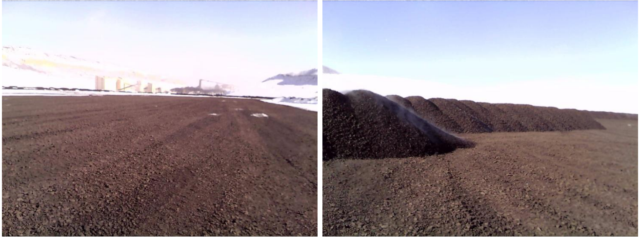
Stockpiled Refuse at RDA

completed. Phase 1 of the RDA expansion is nearing completion. TR67 was approved with a stipulation that future bonding for each phase of construction will be required prior to the initiation of the next Phase. No problems were noted at the RDA.