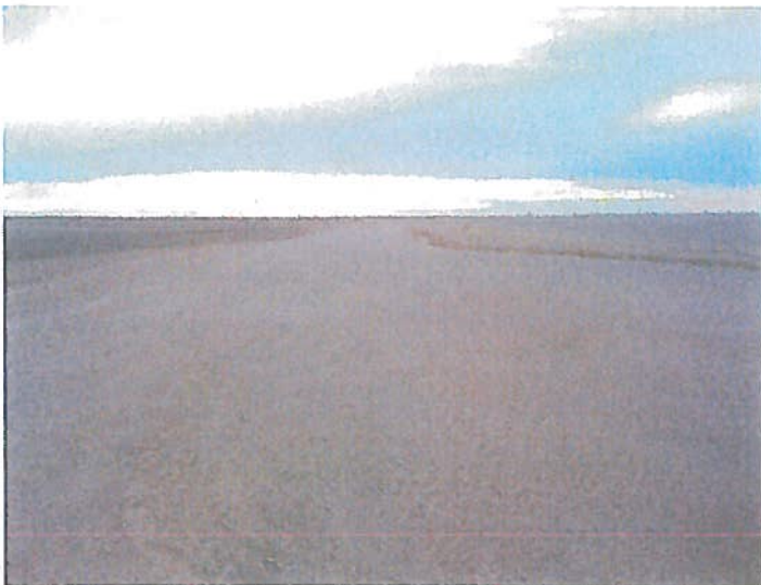
Photo 3: Access road (looking south from vehicle location shown in Photo 2).