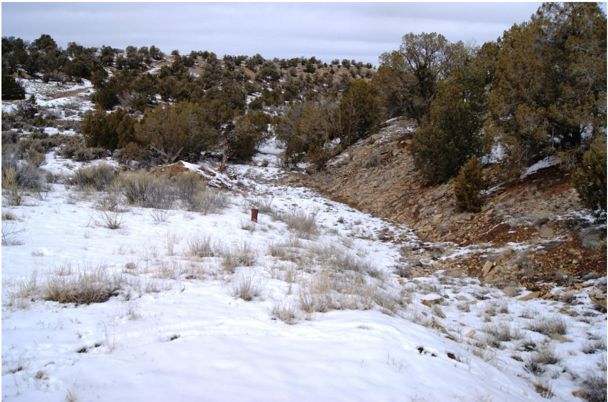
Photo 2 – Spillway and natural channel, looking N from atop Pond B impoundment

Number of Partial Inspection this Fiscal Year: 4