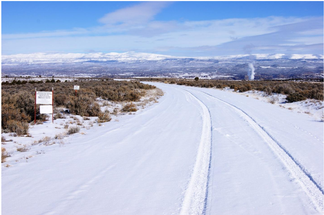
Photo 3 – Permit entrance, looking N; Nucla Generating Station steam plume center-right