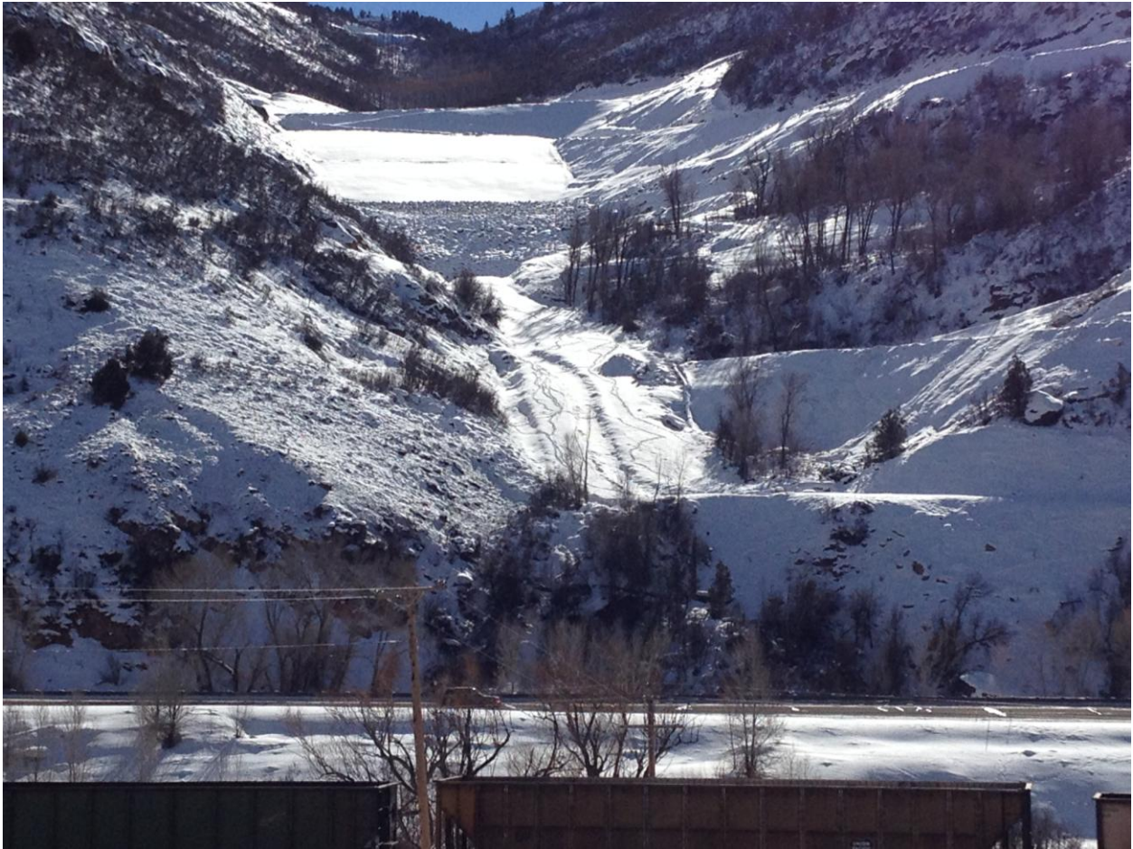
RPEE and ditches – taken from old Highway 133

Number of Partial Inspection this Fiscal Year: 4