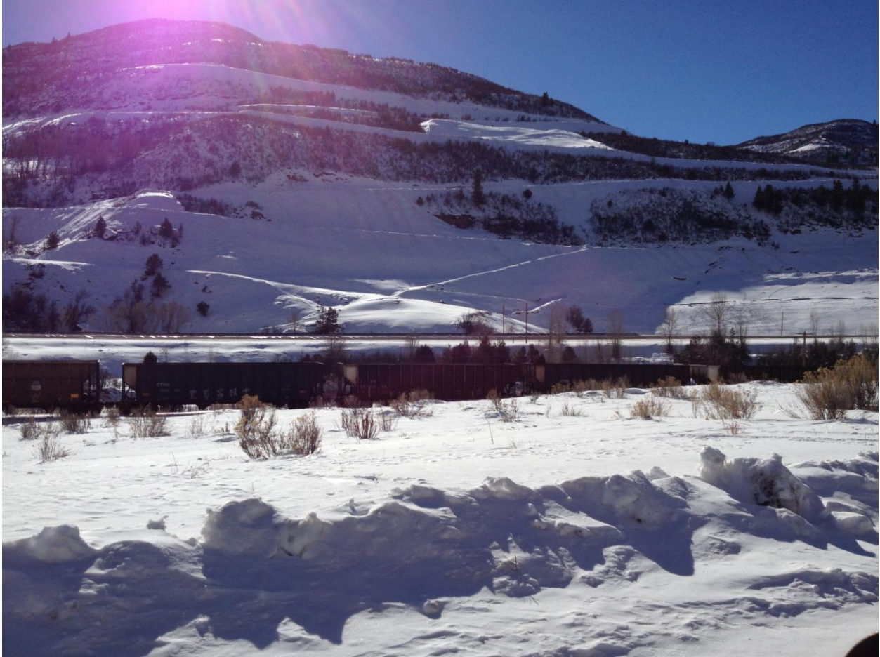
HR-1 slide area – taken from old Highway 133

Number of Partial Inspection this Fiscal Year: 4