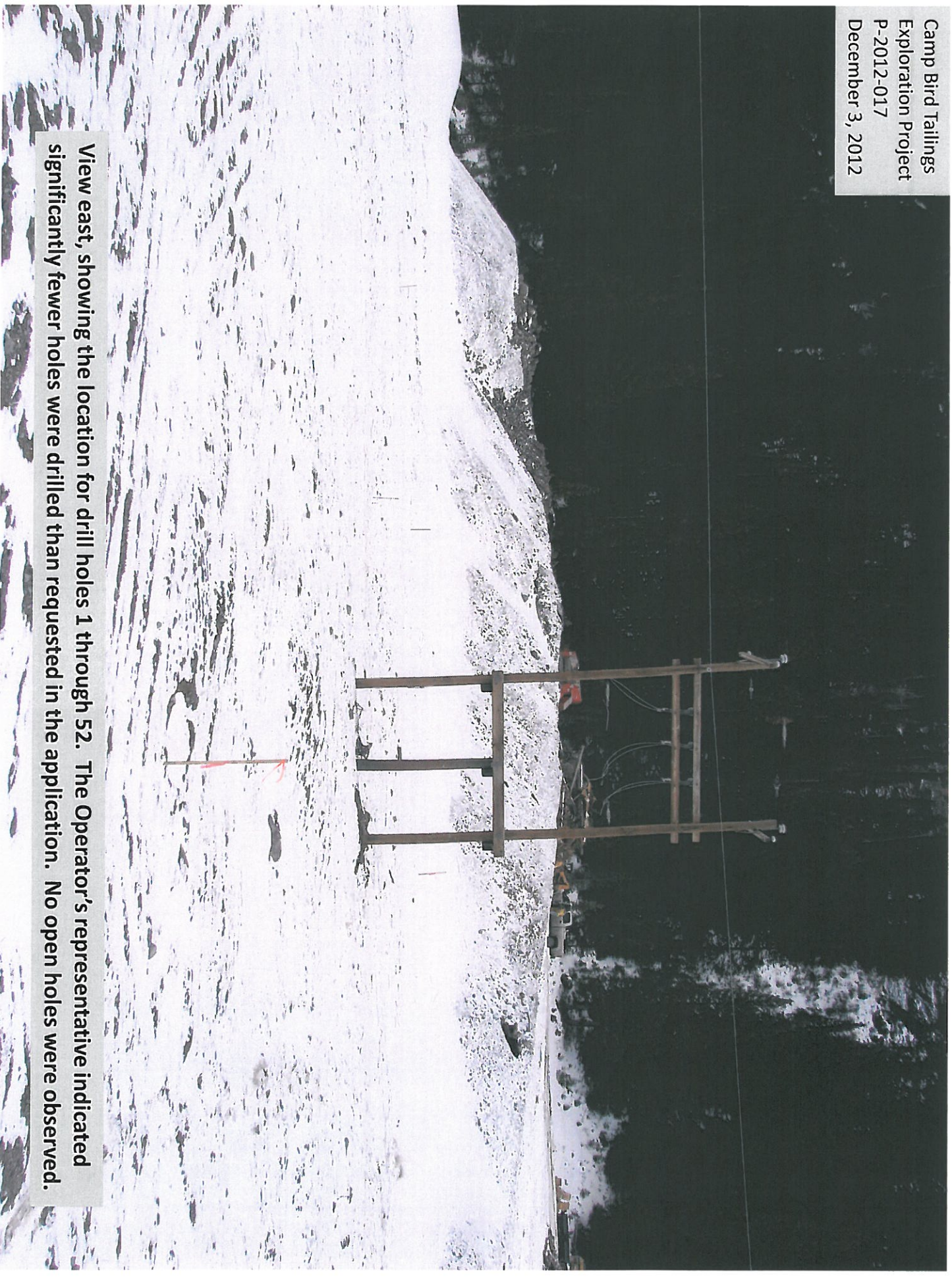
View east, showing the location for drill holes 1 through 52. The Operator's representative indicated significantly fewer holes were drilled than requested in the application. No open holes were observed.