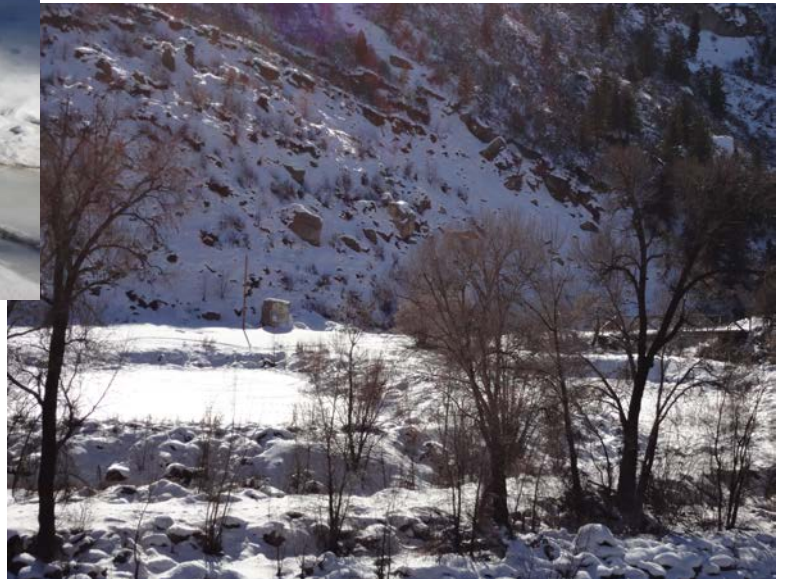
Treatment Pond at Left, Sediment Pond at Right

Number of Partial Inspection this Fiscal Year: 6