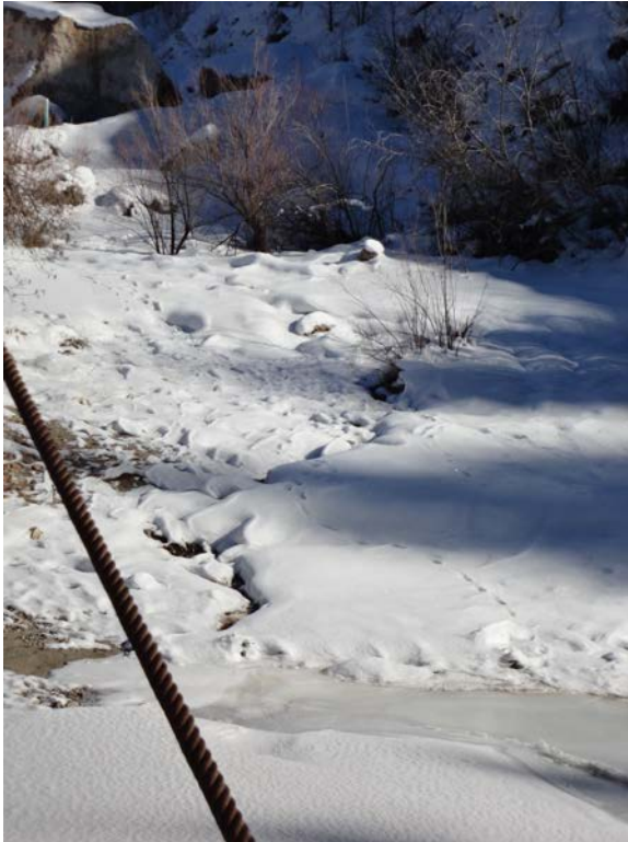
Discharge from spring to North Fork of the Gunnison River