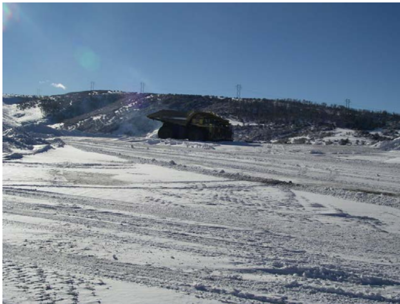
South Taylor Pit – idle haul trucks

Number of Partial Inspection this Fiscal Year: 5