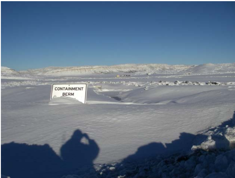
Stoker Siding Pond

Number of Partial Inspection this Fiscal Year: 5