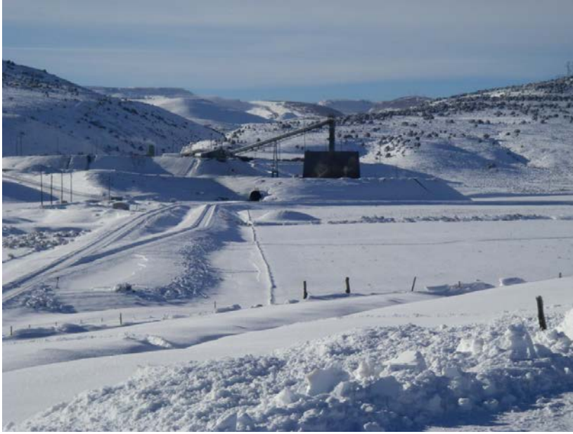
Gossard Loadout (looking south)

Number of Partial Inspection this Fiscal Year: 5