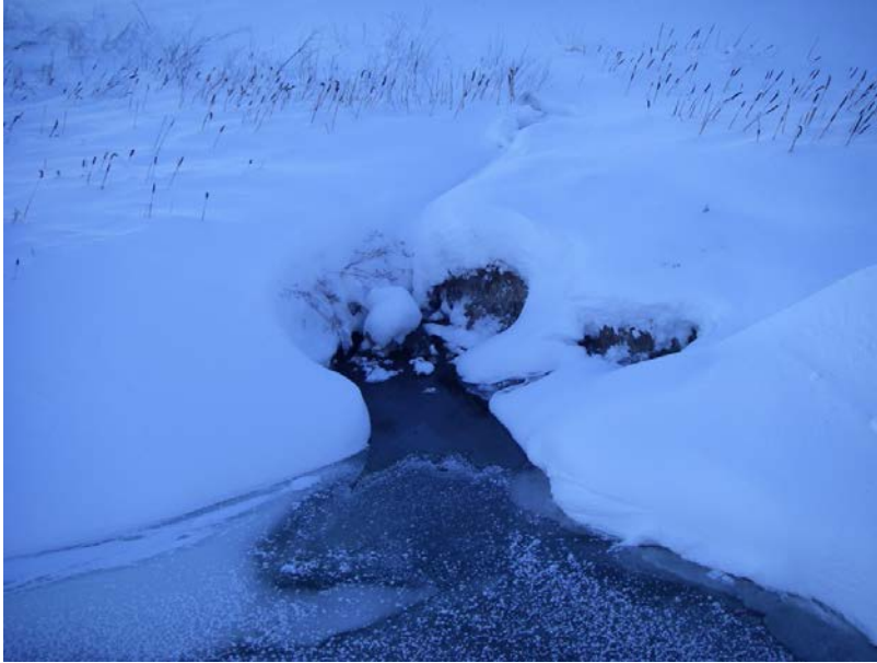
Streeter Pond – sign of discharge