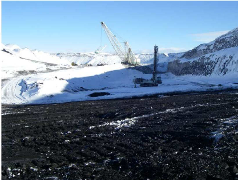
West Pit – idle 103 dragline and drill rig. The 101 dragline is in background, on horizon.