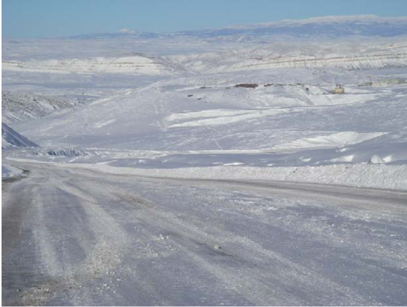
Haul Road to South Taylor (foreground) and West Pit reclamation (looking north)