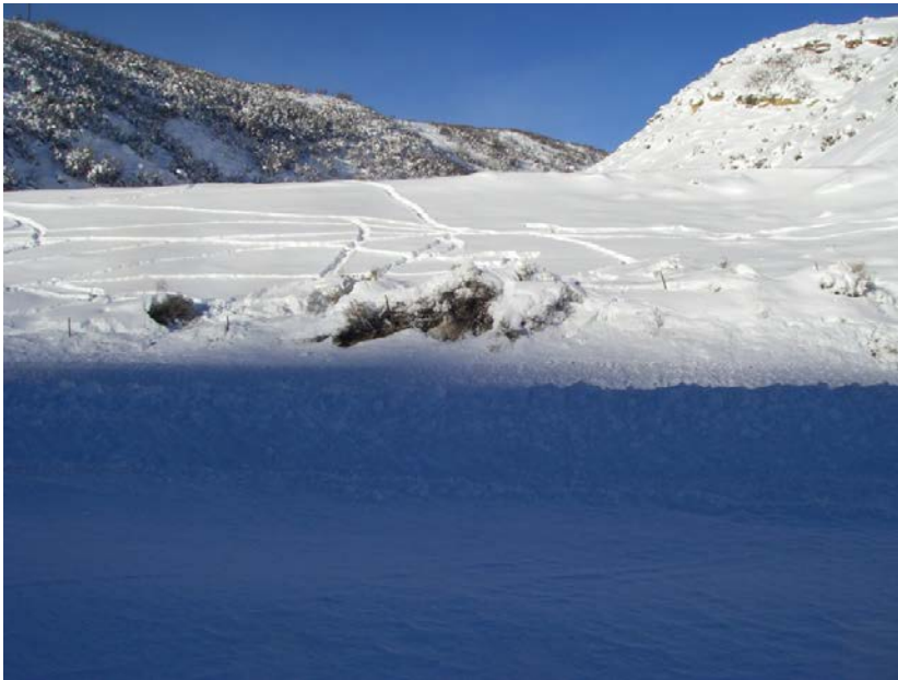
Prospect Pond – embankment (photo from County Road 13)

Number of Partial Inspection this Fiscal Year: 5