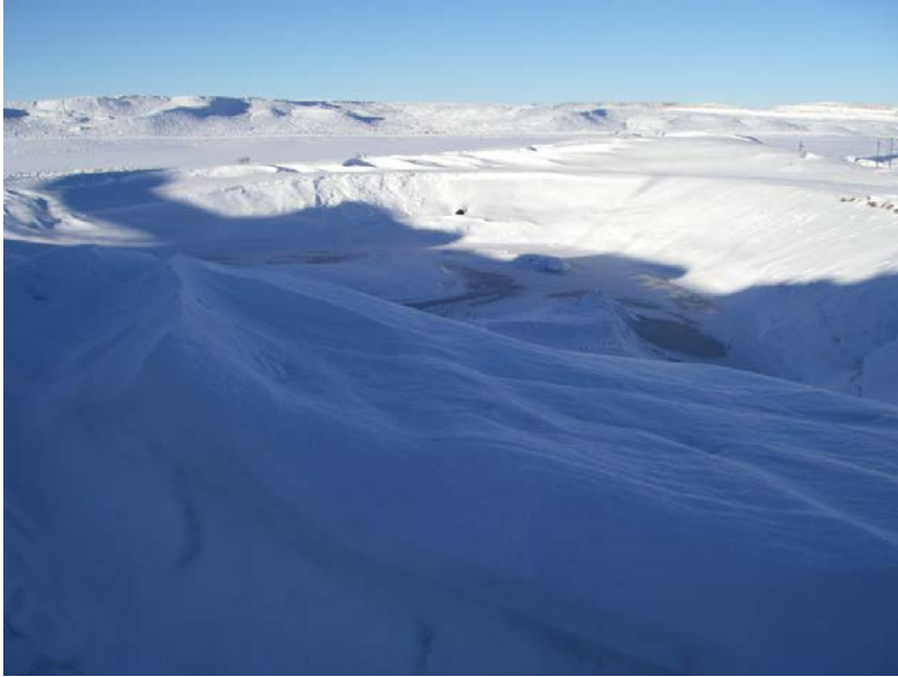
Gossard Pond – water level below pipe invert