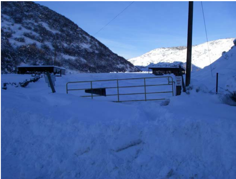
Road to Section 28 Pond

Number of Partial Inspection this Fiscal Year: 5