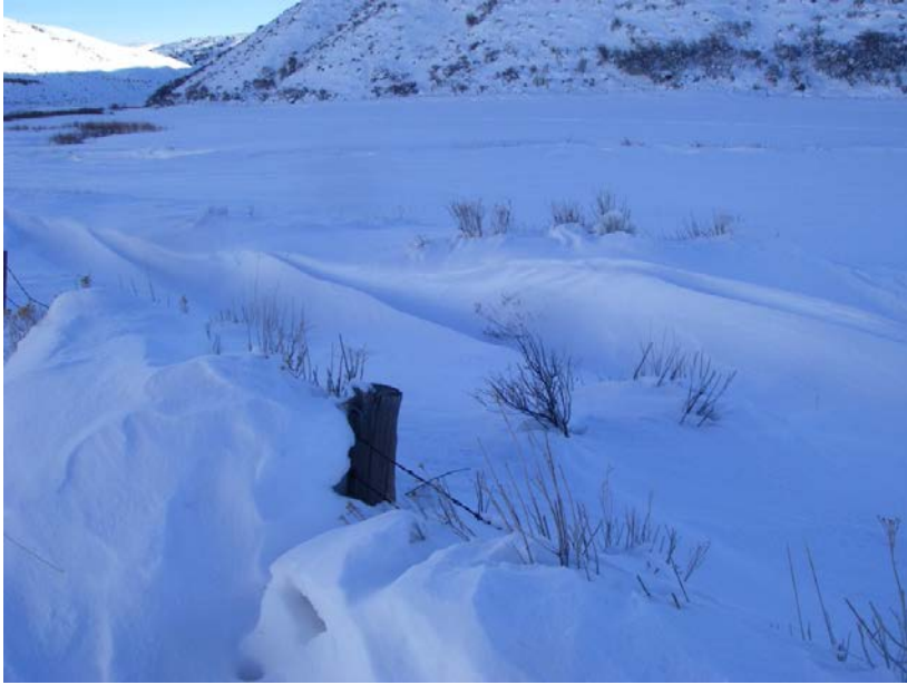
Prospect Pond – flume covered with snow