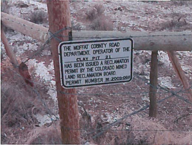
Permit Entrance Sign