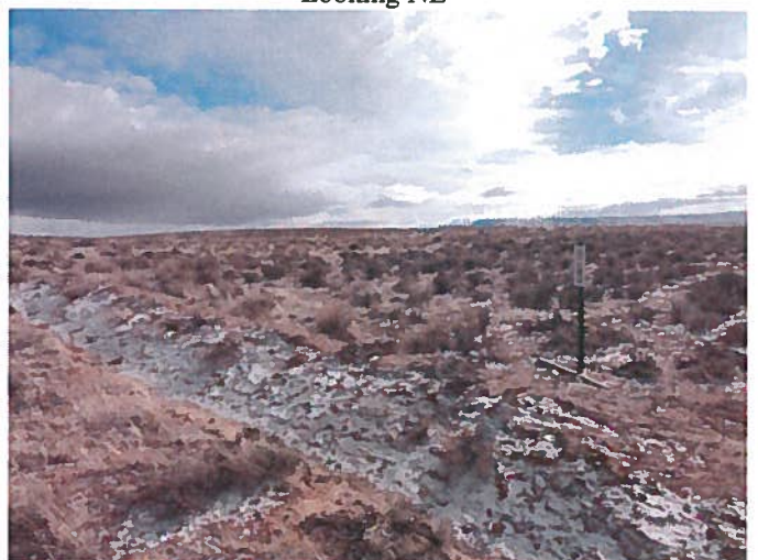
SW Boundary Marker