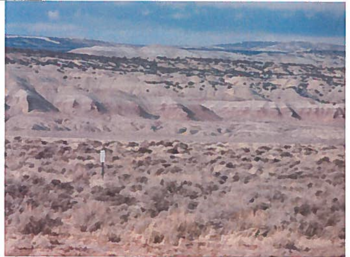
Looking north- not disturbed