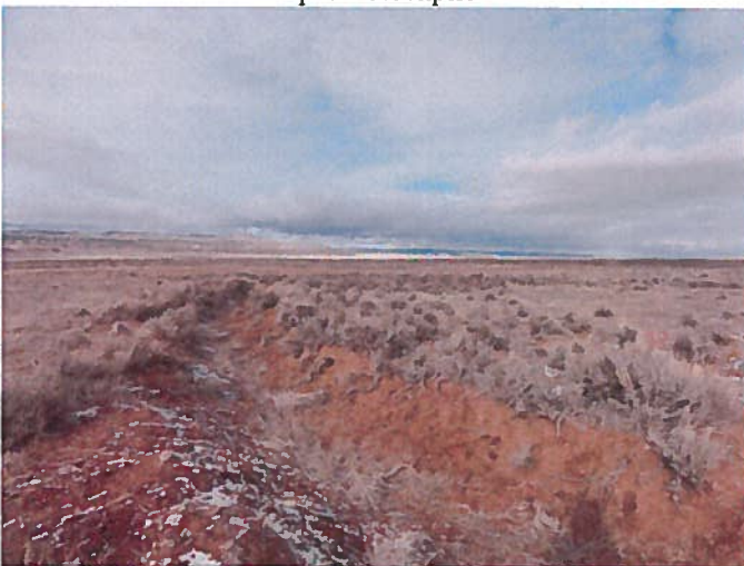
Storm water control ditch around perimeter of pit