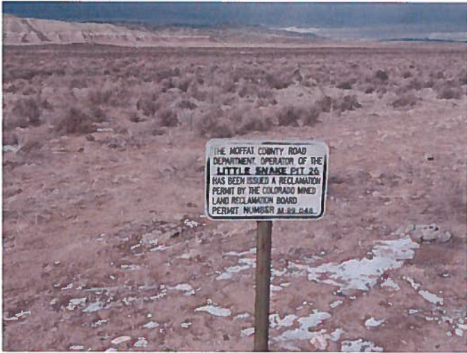
Permit Entrance Sign