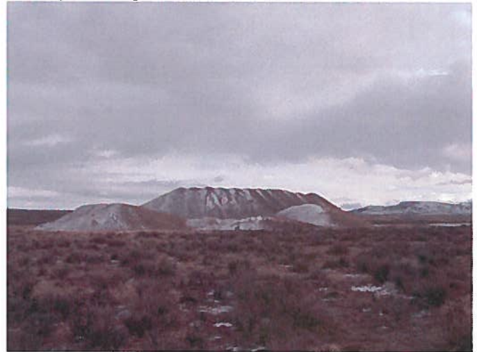
Large Material Stockpile in middle of permit area