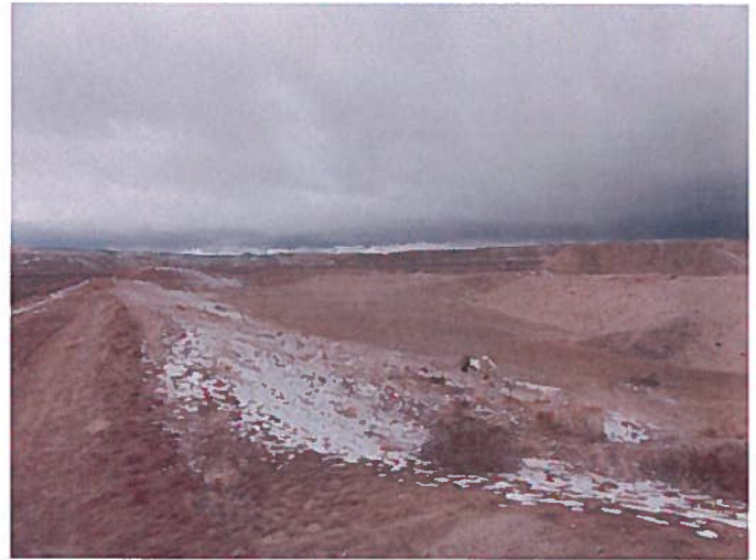
Looking NE into pit