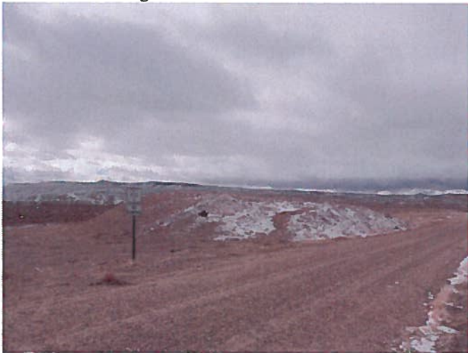
County Road 26