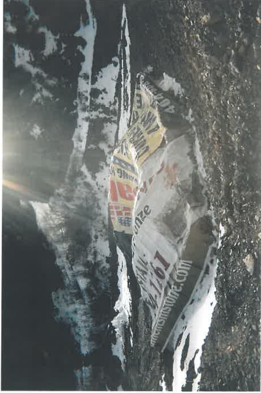
Ruby Trust Mine low grade ore stockpile covering