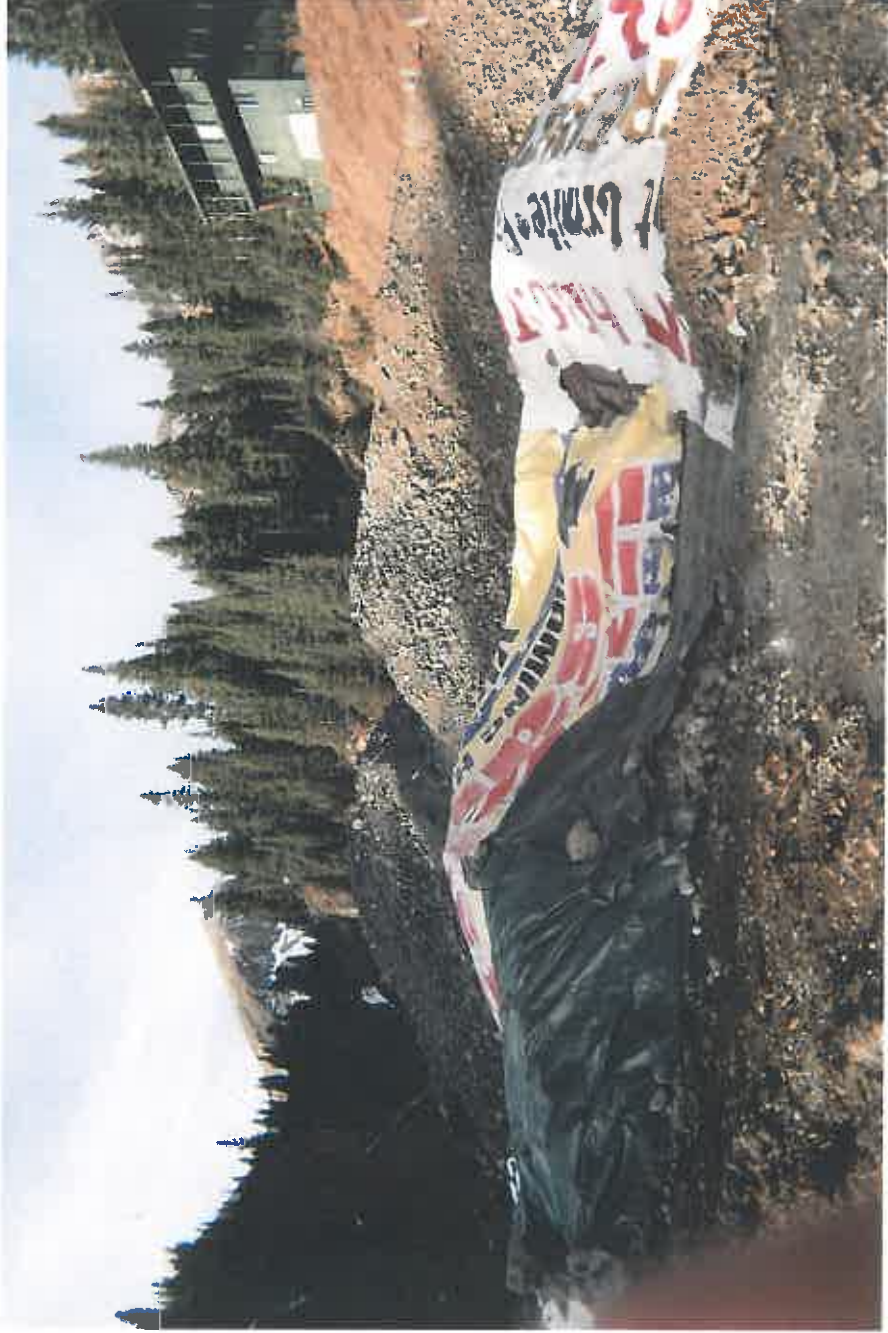
Ruby Trust Mine low grade ore stockpile covering