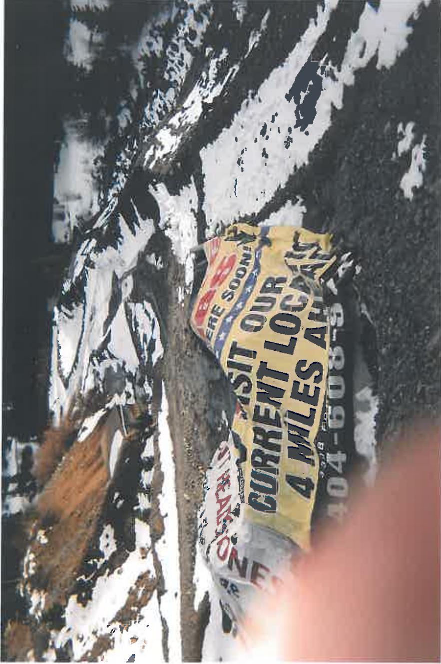
Ruby Trust Mine low grade ore stockpile covering