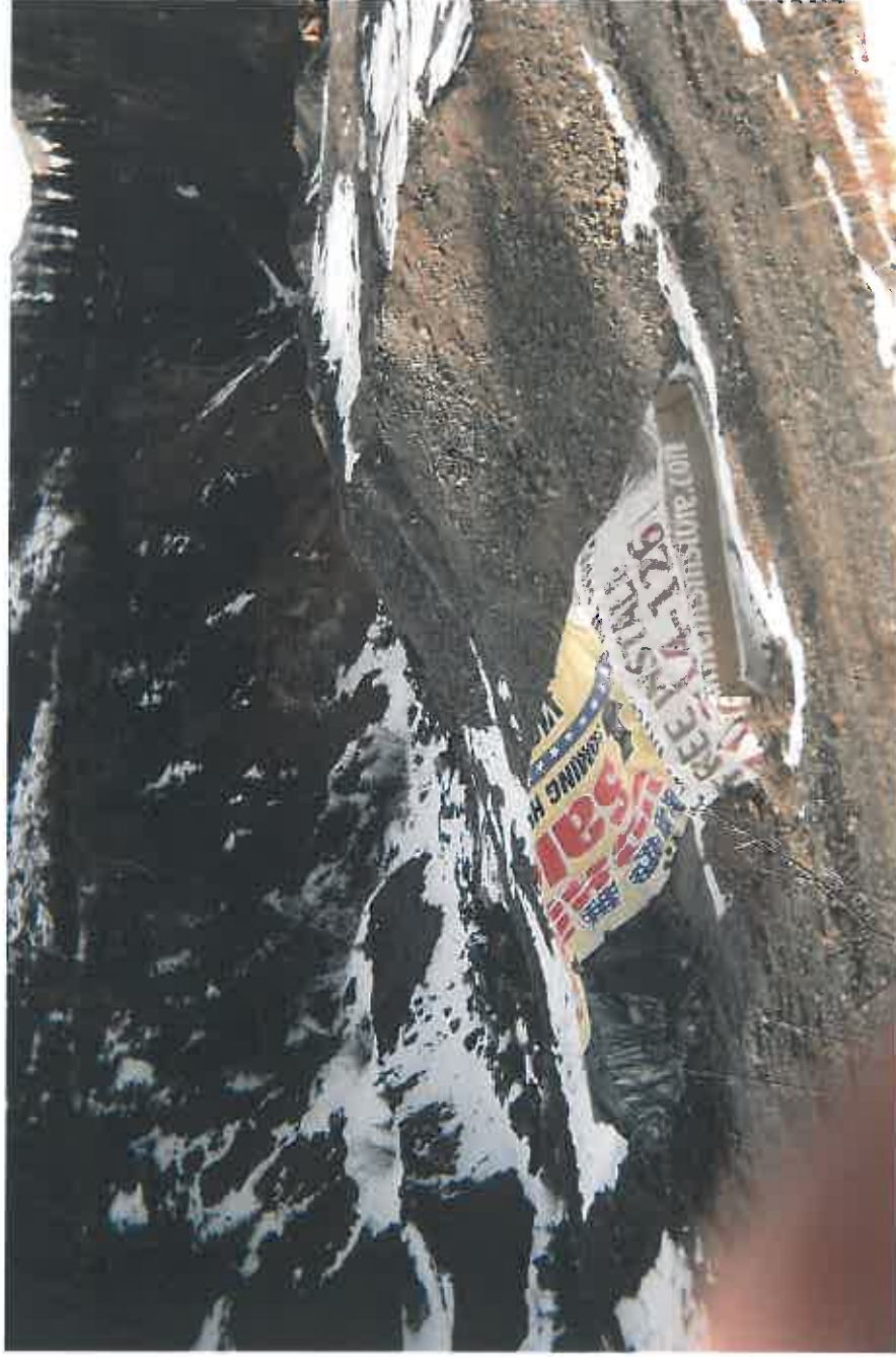
Ruby Trust Mine low grade ore stockpile covering