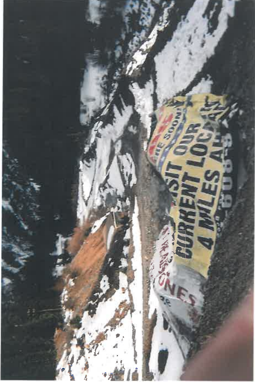
Ruby Trust Mine low grade ore stockpile covering