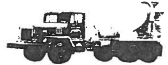
READY MIXED CONCRETE Phone 242-4843