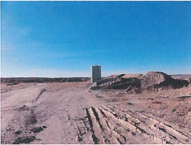
Looking southeast, topsoil stockpiles and frac tank