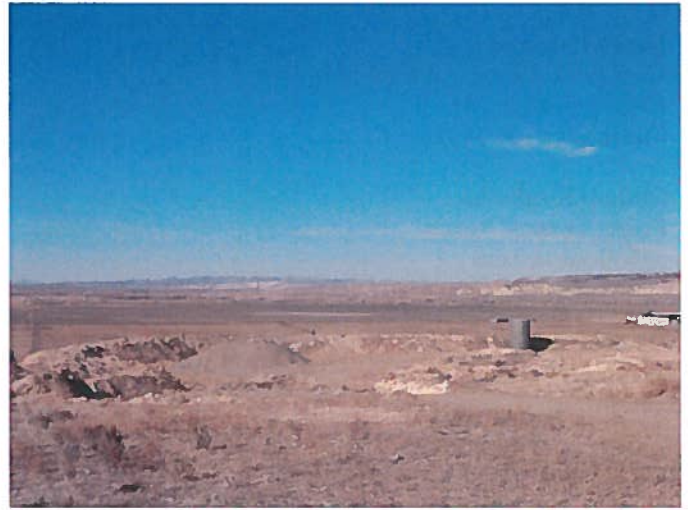
Site looking northwest, with Flying Triangle Ranch on left side of photo