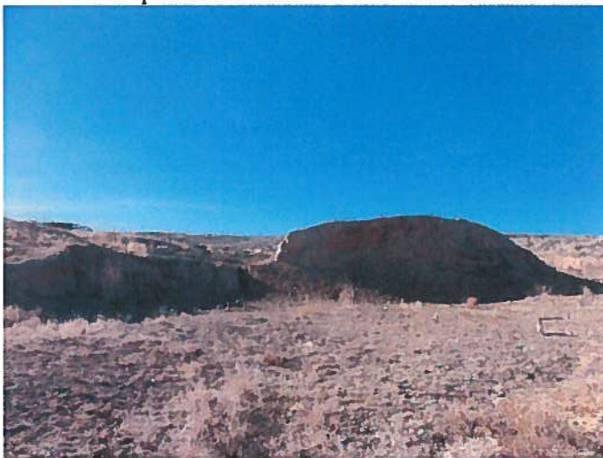
Looking south, topsoil stockpiles