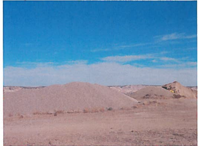
Looking north, material stockpiles