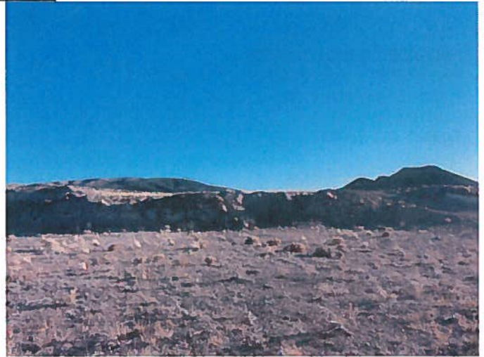
Looking east to 10' highwall