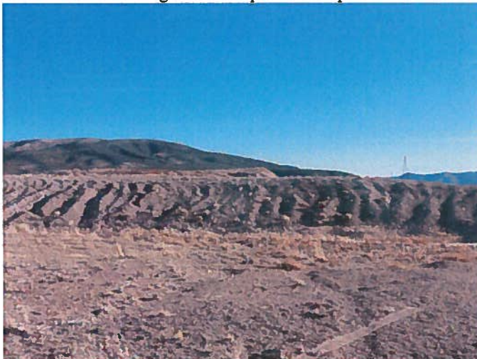
Graded topsoil in efforts to initiate contemporaneous reclamation