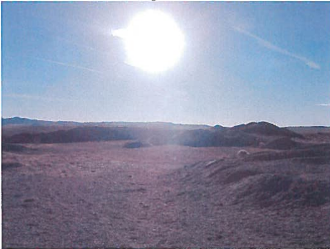
Looking West at top soil stockpiles