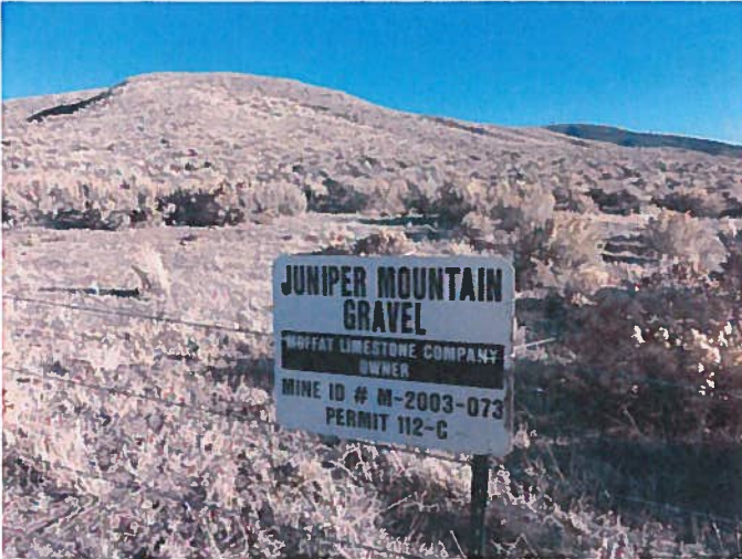
Permit Sign at Entrance