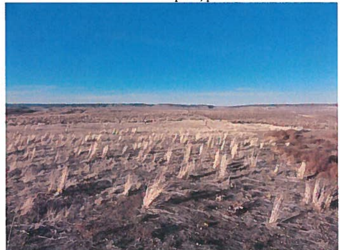
Drill seeded established vegetation