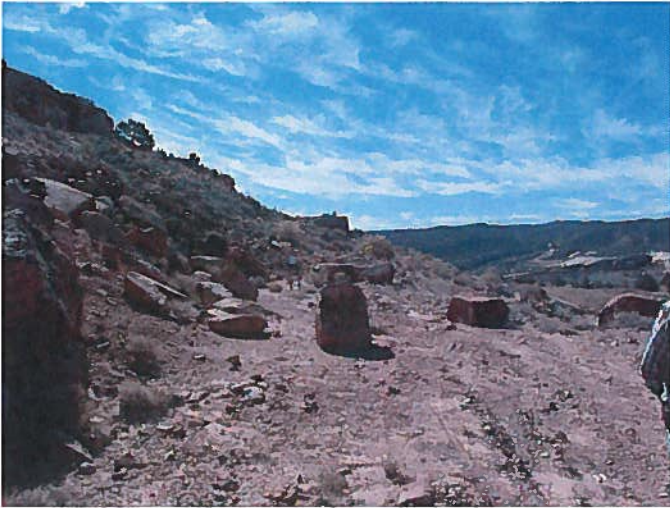
Figure 1: Facing south from access road.