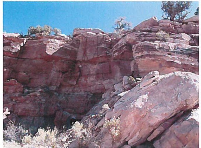
Figure 4: Portal entrance.