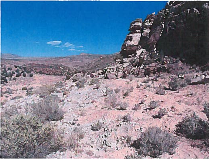
Figure 5: Reclaimed slopes, facing north from near portal.