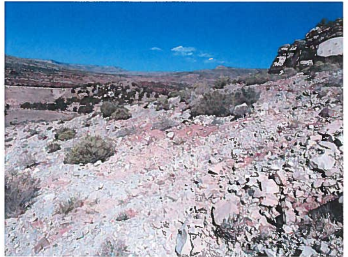
Figure 6: Reclaimed slopes, facing north from near portal.

Glen Williams Cotter Corporation P.O. Box 700 Nucla, CO 81424