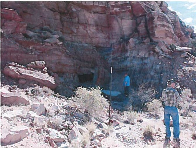
Figure 3: Portal entrance.