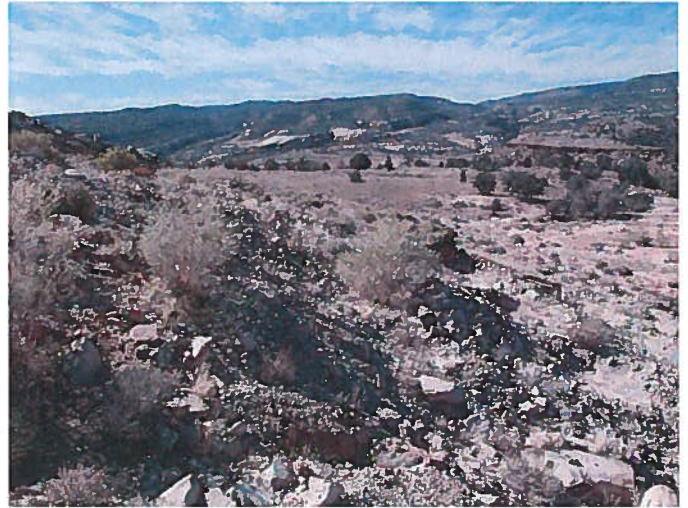
Figure 2: View of reclaimed slopes, facing south.