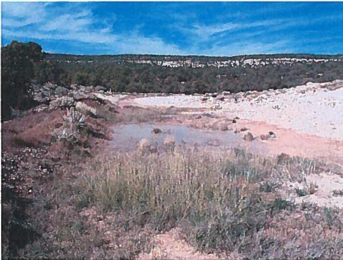
Figure 7: Facing west, from the east side of the sediment pond.