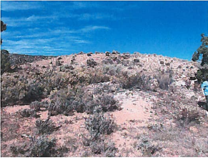
Figure 1: Reclaimed Ike Mine Portal area.