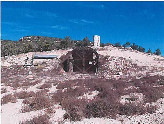
Figure 3: SR-11 Portal.