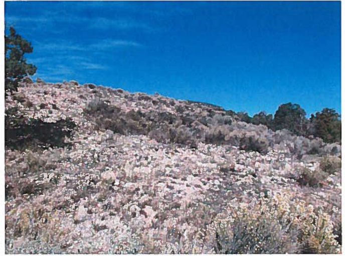
Figure 2: Reclaimed Ike Mine Portal area.