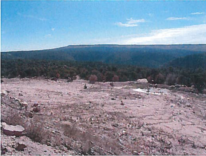
Figure 5: View from the SR-11 mine bench, facing east toward the sediment pond.