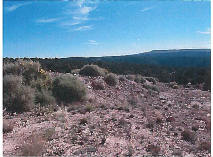
Figure 6: Growth medium stockpiled at the east end of the SR-11 area.