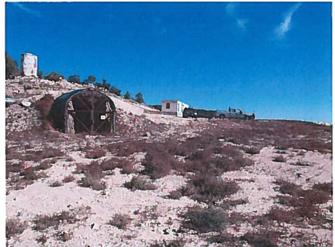
Figure 4: SR-11 Portal and operations area.