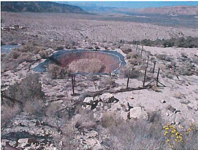
Figure 3: Middle settling pond located just west of the office/shop area.