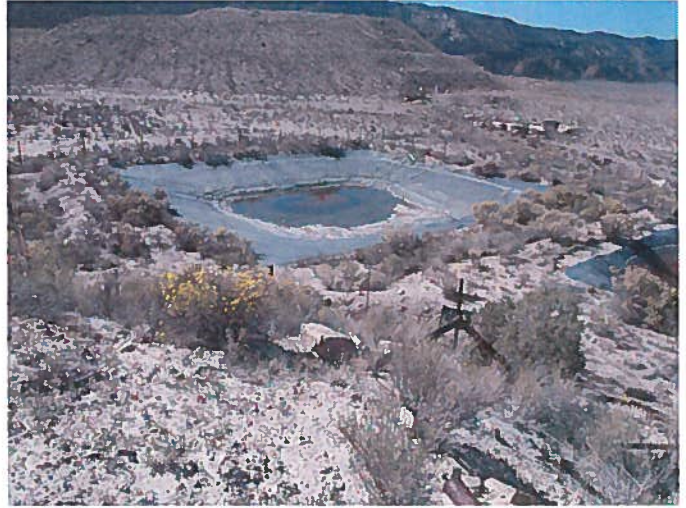
Figure 2: Upper settling pond located just west of the office/shop area.