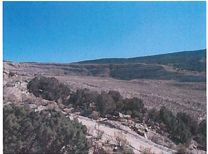
Figure 4: View towards pit and highwall, from the northwest.