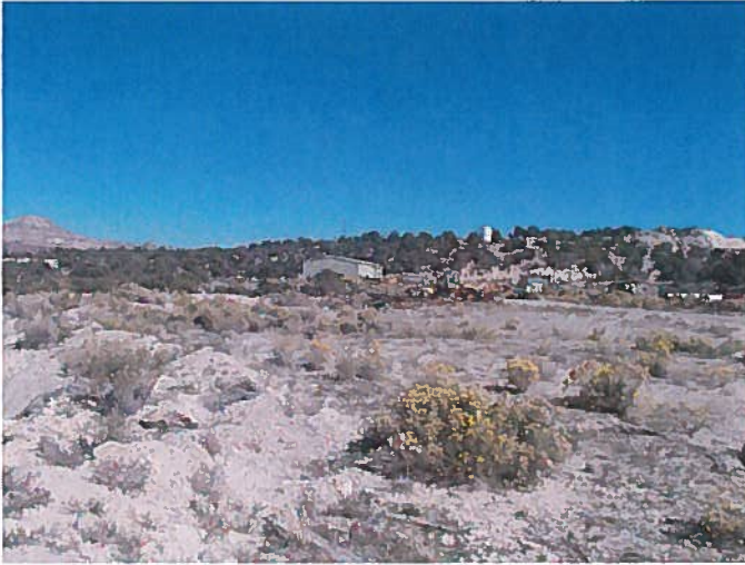
Figure 1: Area around mine office/shop and JD-7 Underground portal.