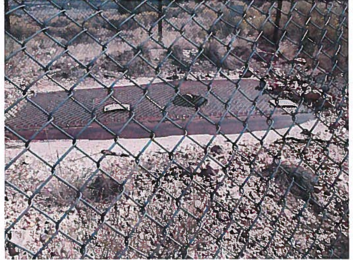
Figure 2: Mineral Joe 12 shaft.