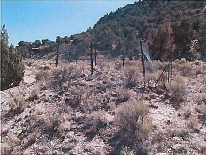
Figure 1: Mineral Joe 12 shaft.