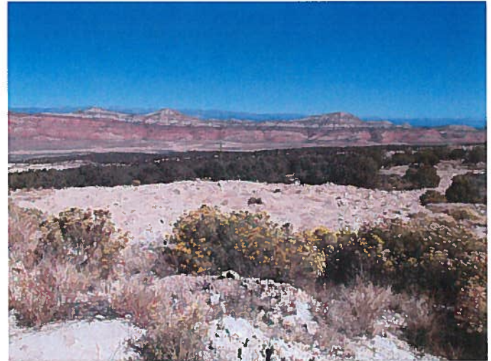
Figure 4: Mineral Joe 2 waste dump area.