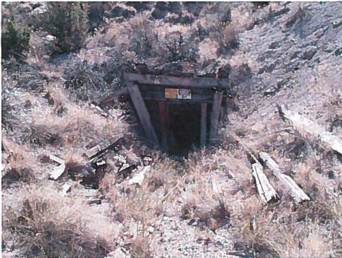
Figure 3: Mineral Joe 2 portal.