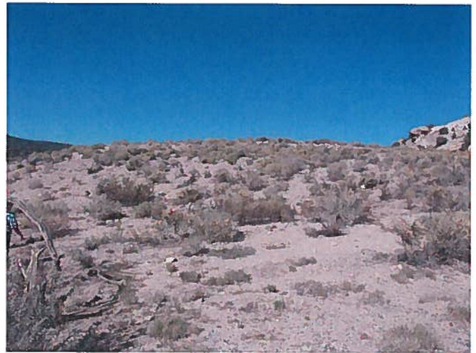
Figure 2: View of the reclaimed waste rock pile.