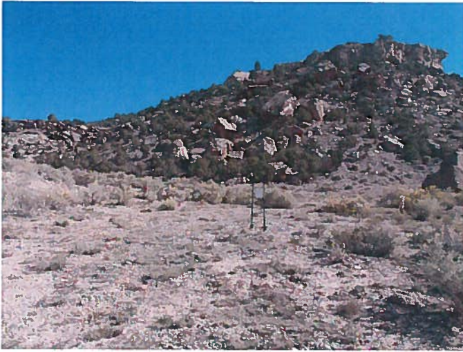
Figure 1: View, facing east, toward the reclaimed portal.