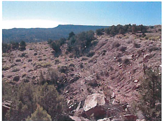
Figure 2: Looking south across affected area.