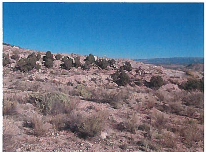
Figure 4: Looking north across the affected area.