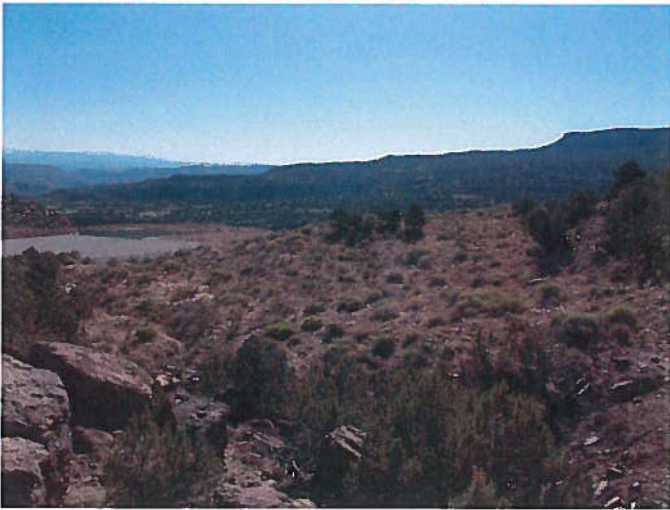
Figure 1: Looking south across affected area.