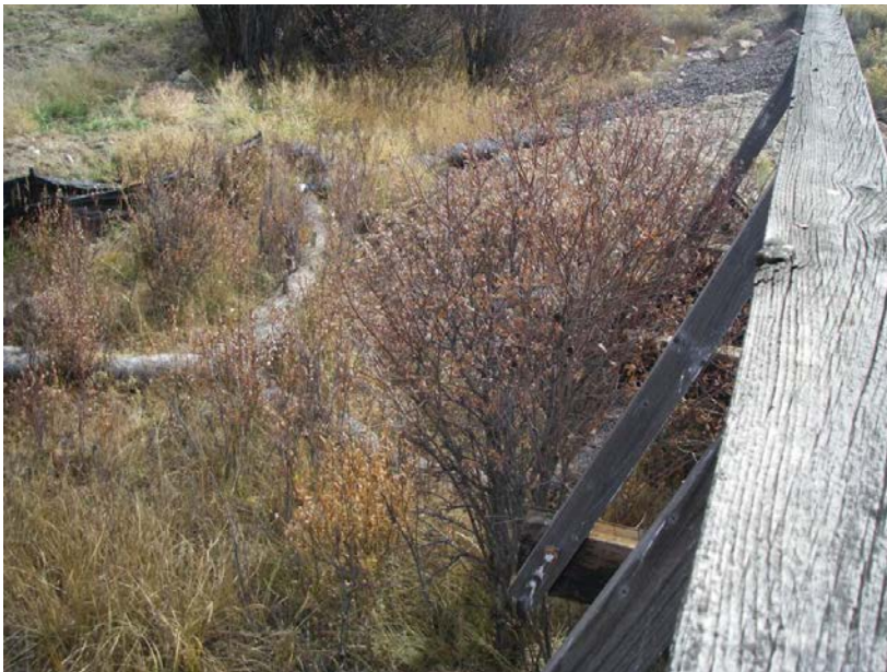
Loadout –straw boom (from bridge)

Number of Partial Inspection this Fiscal Year: 2