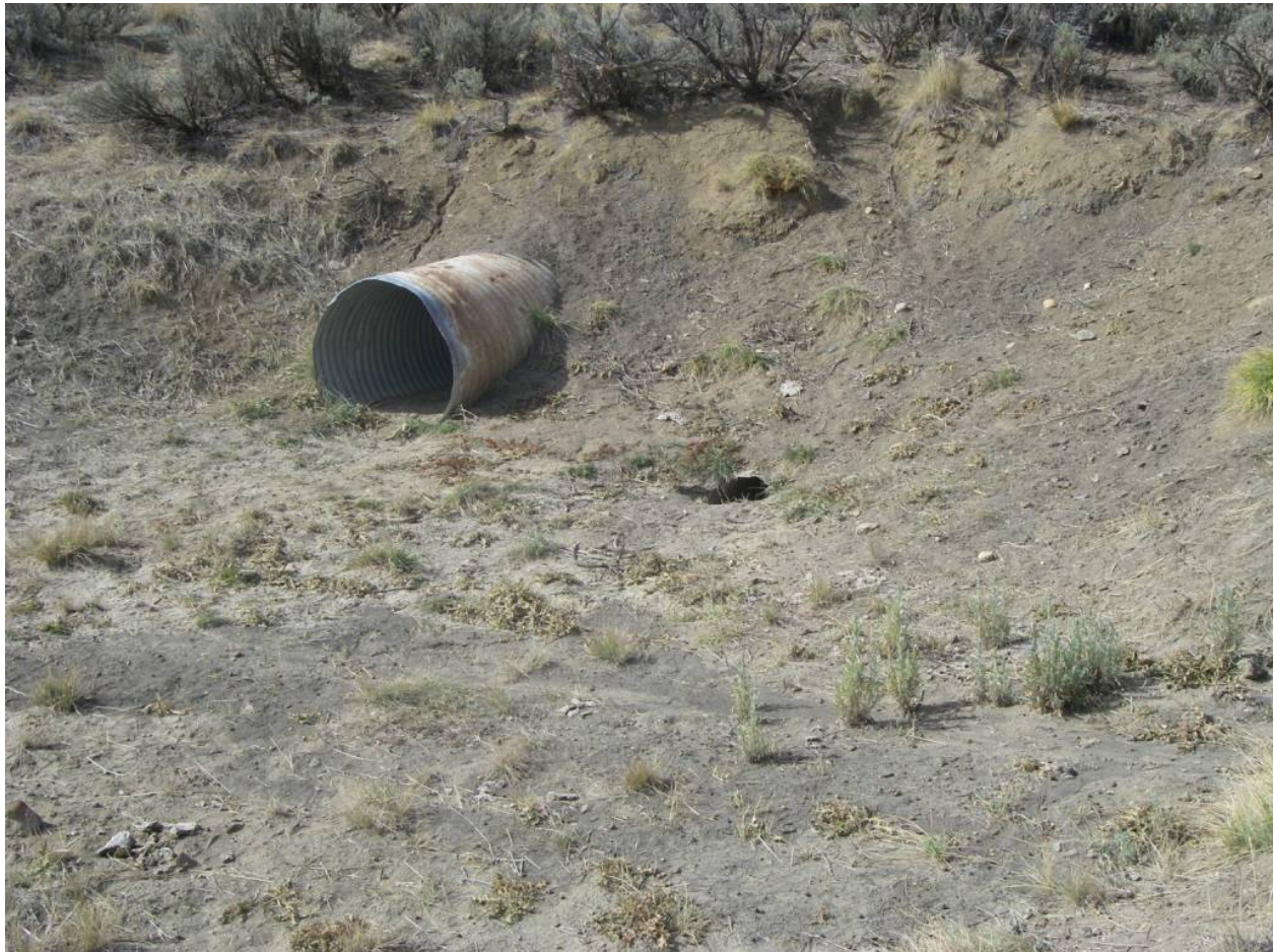
Mine Site - Blocked pipe at southern culvert

Number of Partial Inspection this Fiscal Year: 2