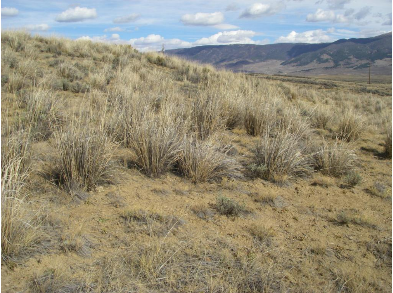
Mine Site – northern unreleased parcel (beside facility area)

Number of Partial Inspection this Fiscal Year: 2