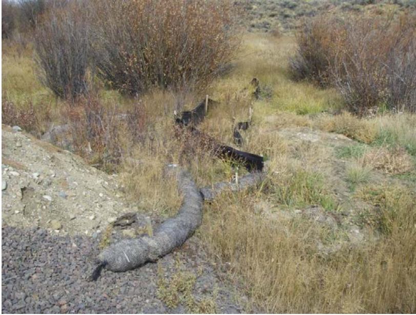
Loadout – silt fence and straw boom