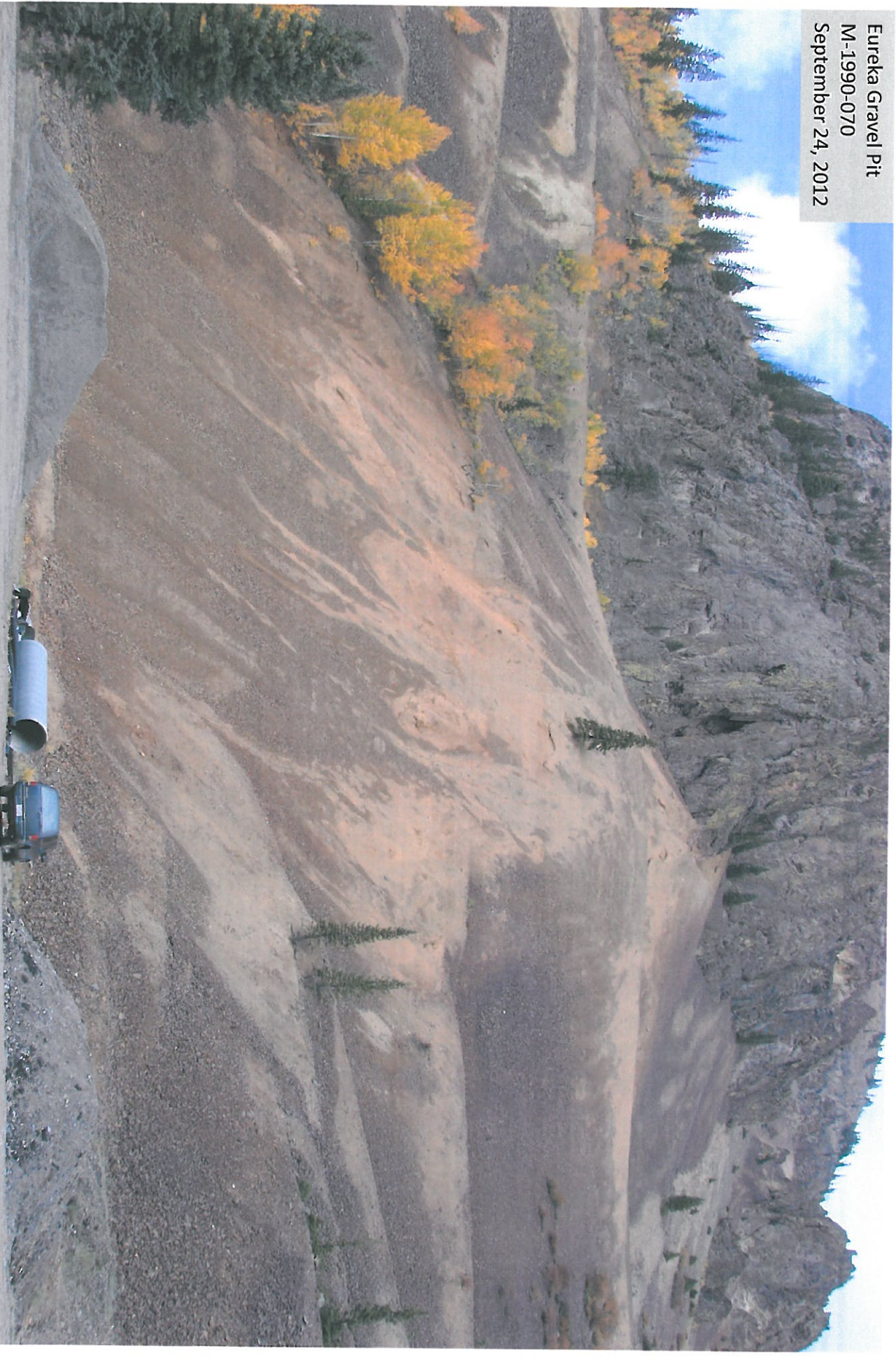
Detail photo showing current condition of the scarp and over-steepened slope resulting from previous excavation occurring at the toe of slope. The Operator has been dumping talus material on the slope, resulting from widening of CR 25, which appears to be restoring the talus slope and healing the scarp.

Eureka Gravel Pit M-1990-070 September 24, 2012