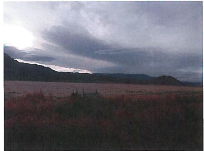
Figure 4: View from the west central part of the site, facing southeast.