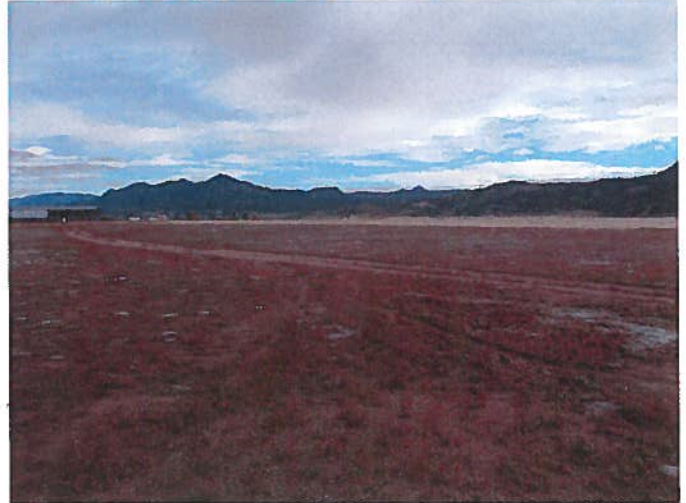
Figure 2: View from the southwest corner of the site, facing north.