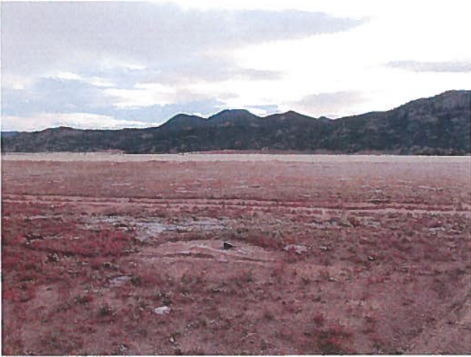
Figure 1: View from the southwest corner of the site, facing northeast.