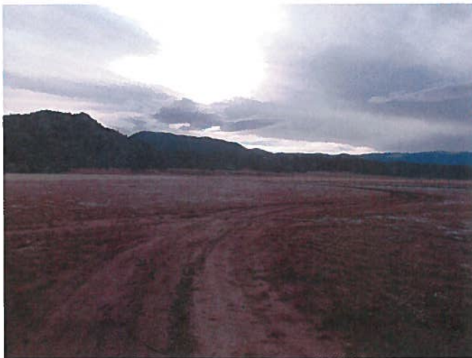
Figure 3: View from the southwest corner of the site, facing east.