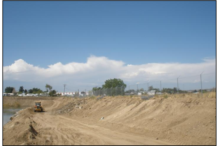
Figure 2 A close up look of the repaired embankment