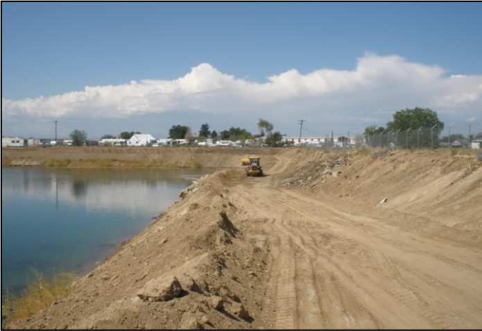
Figure 1 Looking west at the repaired embankment