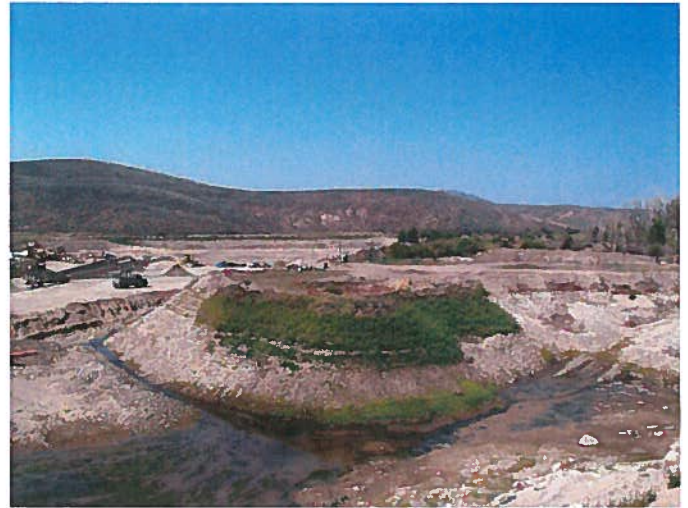
Figure 2: View from north-central part of site, facing west.