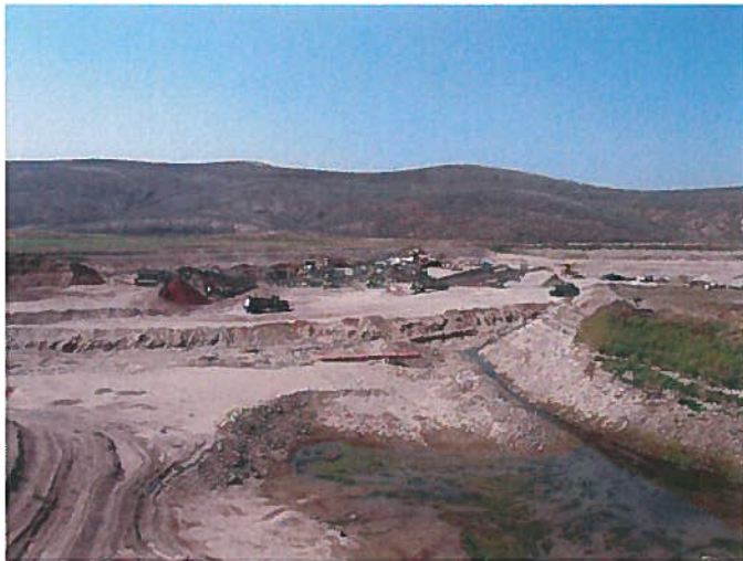
Figure 3: View from north-central part of site, facing southwest.