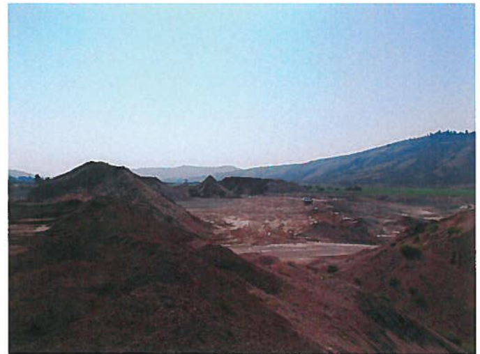
Figure 4: View from north-central part of site, facing east.