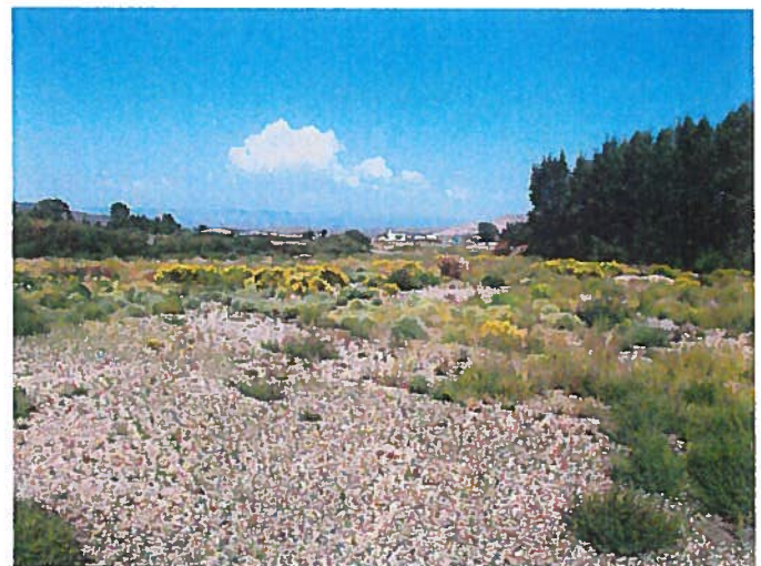
Figure 4: Area east of pond. Noxious weeds were noted in this area.