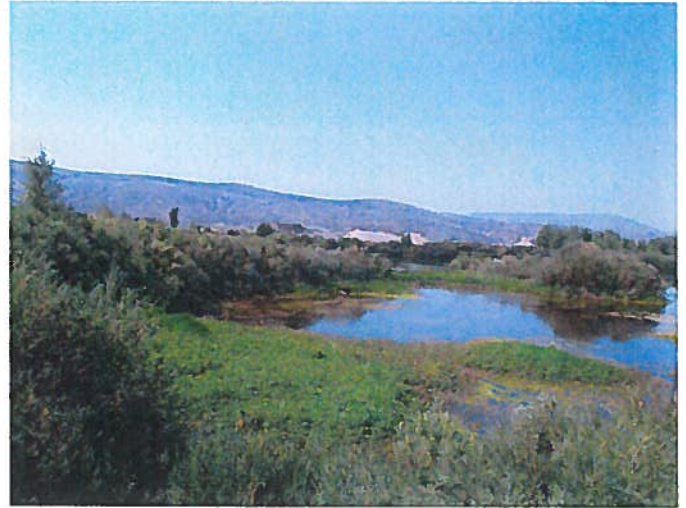
Figure 2: Reclaimed pond in northwest part of permit area.