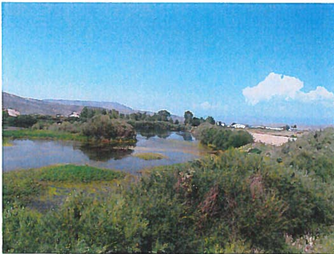
Figure 3: Reclaimed pond in northwest part of permit area.