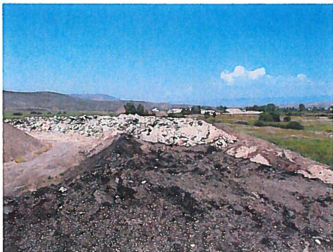
Figure 5: Stockpile area south of Tomichi Creek.