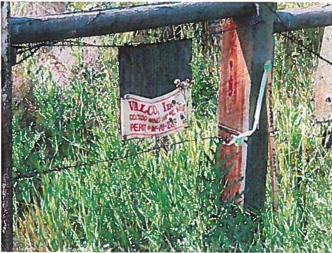
Figure 1: Mine identification sign located at northeast entrance to site.