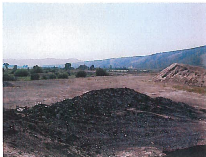
Figure 6: Stockpile area south of Tomichi Creek.