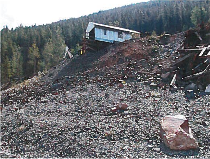
Figure 5: Old load out area.