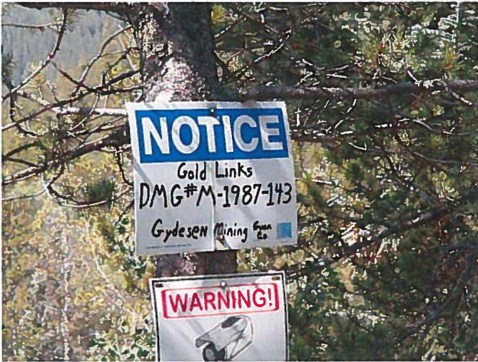
Figure 1: Mine I.D. sign located at site entrance.