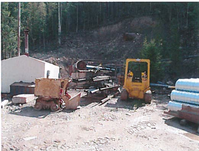
Figure 3: Area outside portal – generator building and ventilation system.