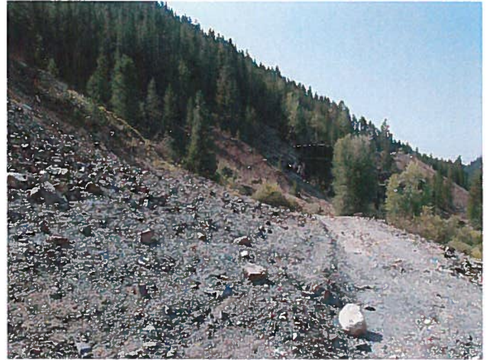
Figure 6: View south toward old mill area.