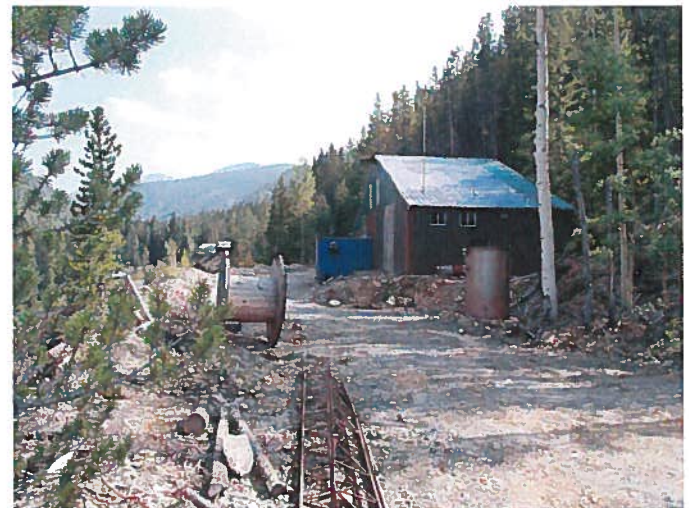
Figure 4: Crushing building located in the south permit area.