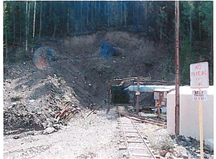
Figure 2: Portal and escapeway.