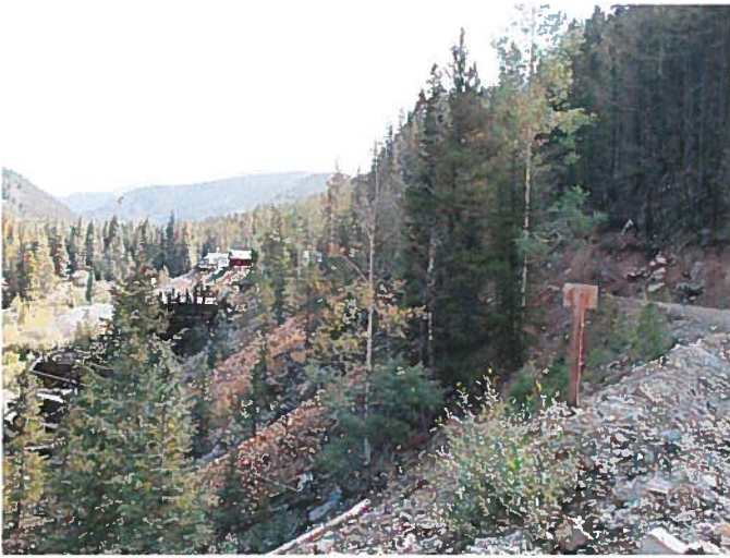
Figure 7: View north from south end of permit area.

Robert Gydeson CRG Mining, LLC 502 S. Wisconsin Street Gunnison, CO 81230