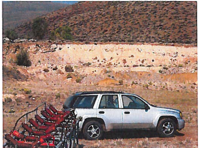
Figure 2: View toward west end of the disturbed area.