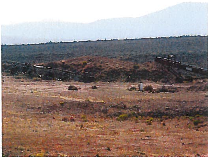
Figure 3: View toward the east end of the disturbed area.