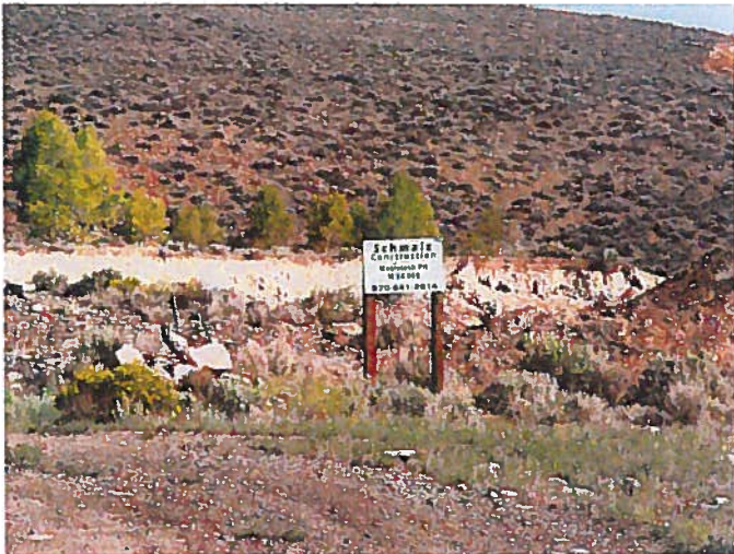
Figure 1: Mine ID sign located at site entrance.