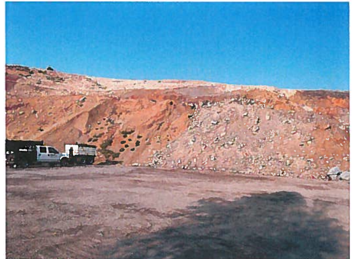
Figure 4: View from the mine floor area, facing southwest.