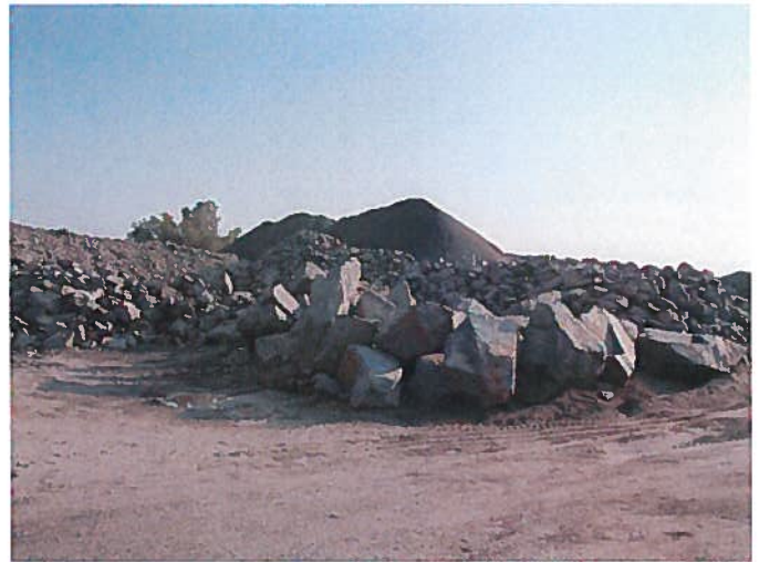
Figure 6: View from the mine floor area, facing north.