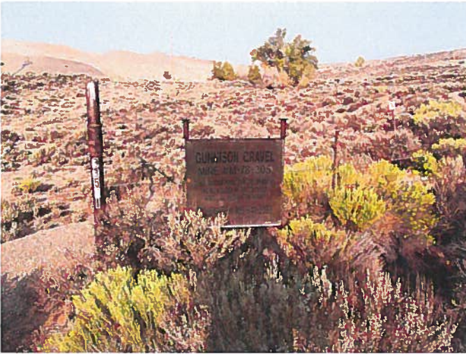
Figure 1: Mine ID sign located at site entrance.