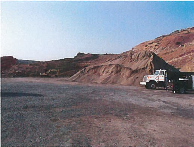
Figure 3: View from the mine floor area, facing south.