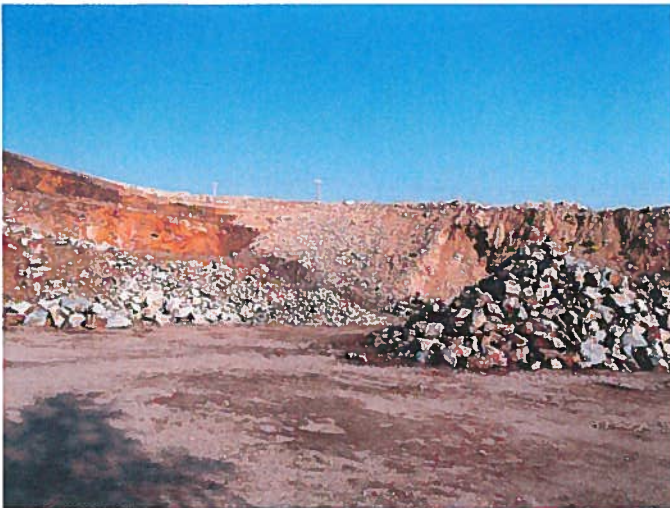
Figure 5: View from the mine floor area, facing west toward the active mine face.