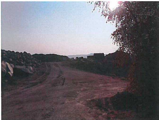
Figure 7: View of refuse storage area at the east side of the mine bench.