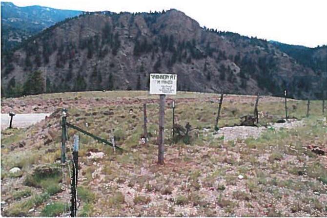
Figure 1: Mine ID sign located near site entrance from Hwy 149.