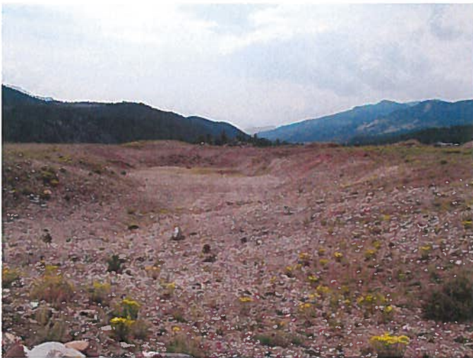
Figure 3: View of pit, facing south.