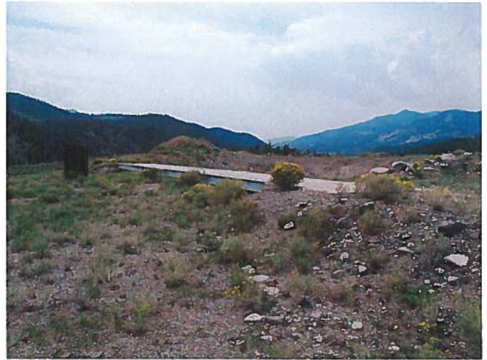
Figure 2: Scale and scale house located at northeast rim of pit.