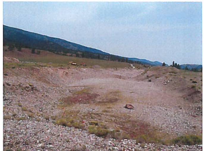
Figure 4: View of pit, facing north.